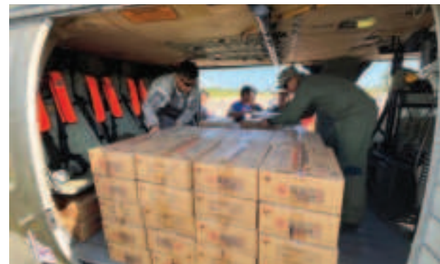
CALAMITY AID. Personnel from the Department of Social Welfare and Development in Soccksargen, with support from the Philippine Air Force and the Philippine Coast Guard, deliver family food packs to residents of Glan, Sarangani on Tuesday (June 9, 2026), a day after a magnitude 7.8 earthquake struck the province and several parts of Mindanao. Following the declaration of a state of calamity, a 60-day price freeze has been imposed in General Santos City to prevent increases in the prices of basic commodities.