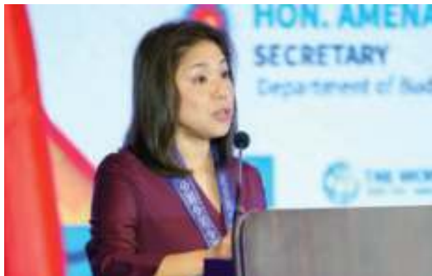
Budget Secretary Amenah Pangandaman. (File photo)

“Every once in a while, in fact, bago mag-eleksyon may mga bilin po siya. Upuwan po namin lagi