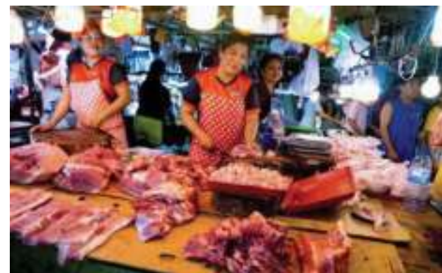
CHICKEN SUPPLY. Vendors attend to customers buying pork and chicken at a market in Caloocan City in this 2024 file photo. The Department of Agriculture on Monday (May 19, 2025) assured there will be no issue with the supply of chicken meat in the country despite a plan to impose an import ban on poultry products from bird flu-affected Brazil.

“Ang advantage lang ng Brazil, kaya malakas sila, dahil sila ang (Turn to p. 2)