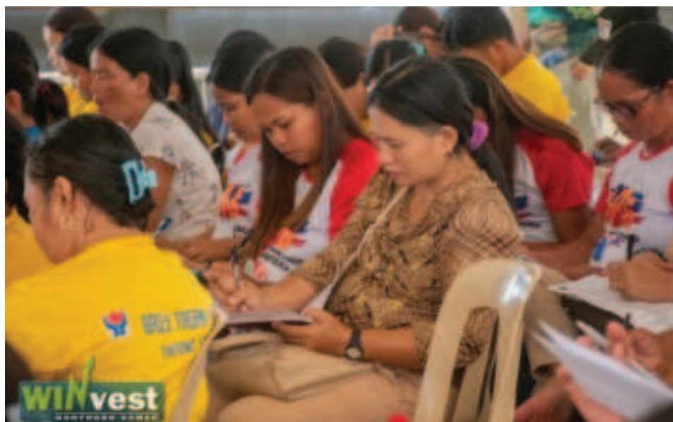
4PS GRADUATES. Graduates of the Pantawid Pamilyang Pilipino Program (4Ps) in Las Navas, Northern Samar attend an assessment seminar by the provincial government on Aug. 22, 2025. The latest Ulat ng Bayan survey by Pulse Asia conducted Sept. 27-30 showed that a large

majority of Filipino adults are in favor of the 4Ps.