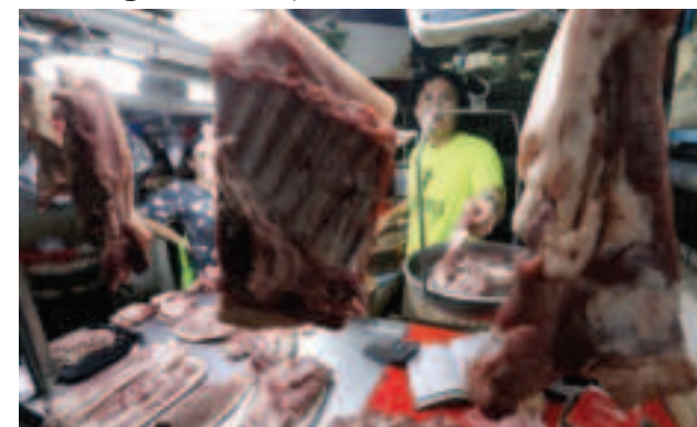
TEMPORARY BAN. Pork products are on display for sale in Paco Public Market in Manila in this August 2024 photo. The Department of Agriculture on Monday (Dec. 8, 2025) said a temporary ban on the importation of live pigs, pork meat, pig skin and other pork-based products from Taiwan has been issued, following the confirmation of an African swine fever outbreak there.

majority of Filipino adults are in favor of the 4Ps.