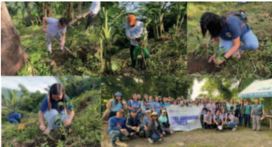
PGC Employees Mark Civil Service Month with Tree Planting Activity in Tagaytay In celebration of the 125th Philippine Civil Service Anniversary, the Provincial Gov-

This emphasizes the Provincial Government of Cavite's steadfast commitment to address unemployment, empower the local workforce, and steer economic growth in the province.--- OPIO