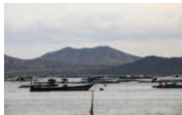
Taal Volcano (File photo)