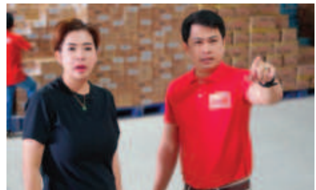
Laguna Governor Sol Aragonés with Laguna Provincial Disaster Risk Reduction and Management Office Department Head Aldwin Cejo during the inspection at the Action Center in Laguna Sports Complex, Santa Cruz, Laguna.

Pinapakita po natin dito ang kahandaan ng bawat isa, na gaya ng sinasabi ng ating mga kasama, na sa bagyo naka-prepare po tayo.” (Turn to p. 2)