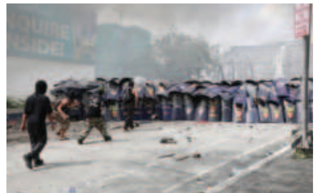
VIOLENT PROTEST. Police clashed with masked protesters in Manila as rallies against corruption turned violent, with rocks, bottles, and fire used against barricades in areas near Malacañang on Sunday (Sept. 21, 2025). The Department of the Interior and Local Government (DILG) on Monday (Sept. 22) said at least 95 police personnel were hurt, some seriously.