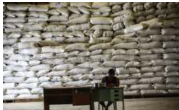
RTL AMENDMENT. Sacks of palay (unhusked rice), procured from local farmers, fill a National Food Authority warehouse in San Ildefonso, Bulacan, on June 7, 2024. Agriculture Secretary Francisco Tiu Laurel Jr. on Tuesday (Aug. 12, 2025) expressed confidence in the Senate's backing to advance amendments to the Rice Tariffication Law (RTL), which aims to restore the regulatory functions of the NFA.

The agriculture chief, in turn, expressed (Turn to p. 2)