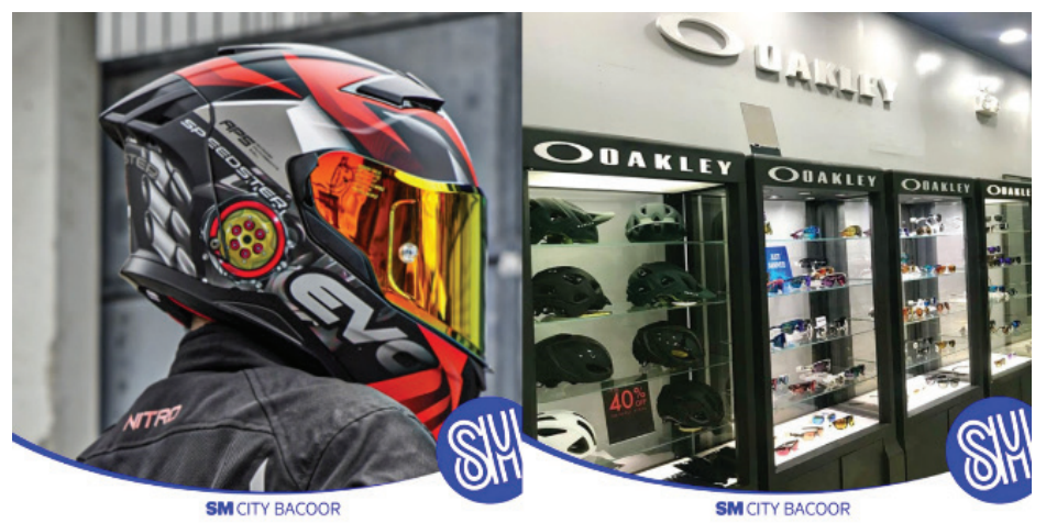
Evo Helmet at Moto

If your dad enjoys an active lifestyle, SM Supermalls has plenty of deals on sports and fitness equipment. From gym gear and outdoor essentials to sports apparel and footwear, you'll find everything you need to support your dad's fitness goals.