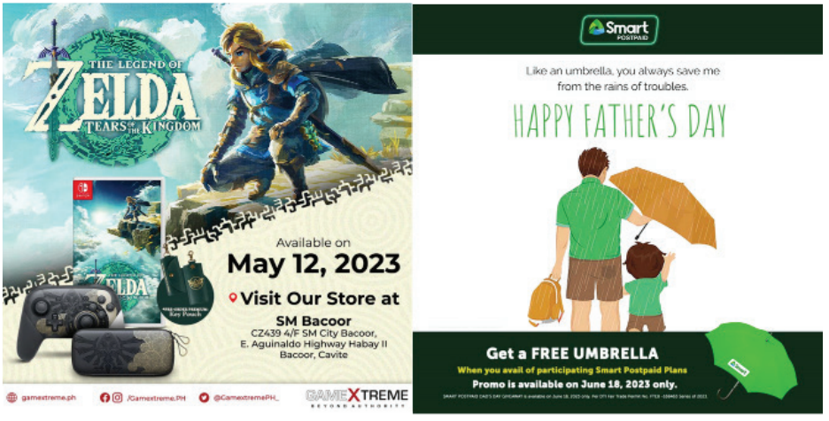
Fun console games at GameXtreme