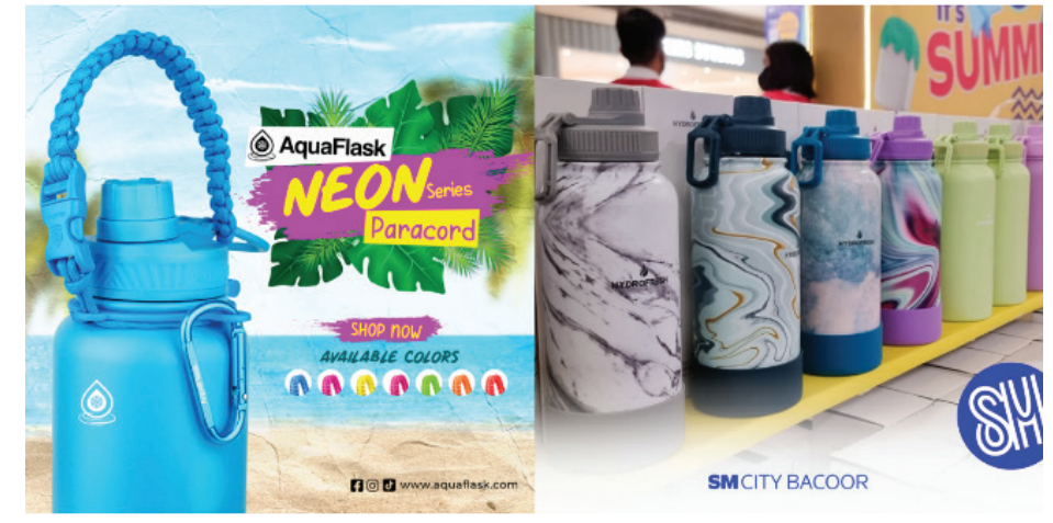
Neon Series tumblers at AquaFlask