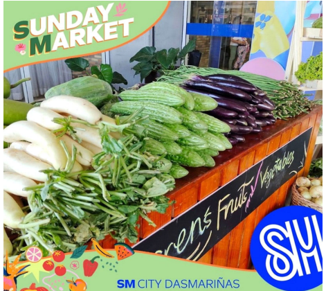
Who's bitter? Serve 'em some Sauteed Bitter Melon with egg from the fresh produce you can find at the SM Sunday

What could go wrong with Tortang Talong? Get the freshest, organic eggplants you can roast and made into eggplant omelette. You can also level up the dish with some fresh tomatoes, white or red onion, and bell peppers for a healthier and more flavorful viand.