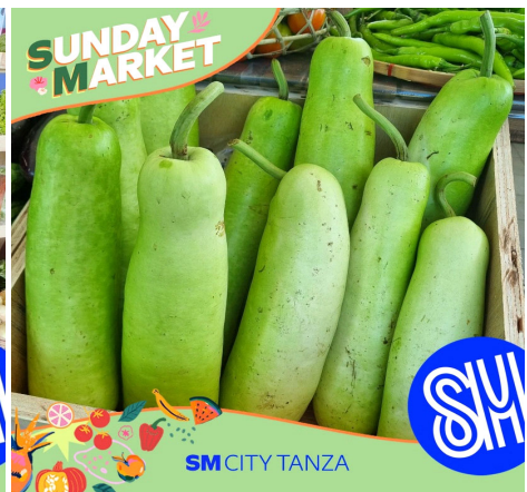
Who wants some soup to pair up with your fried fish or chicken? Get some fresh Upo or Bottle Gourd from the Sunday Market and saute them with egg,