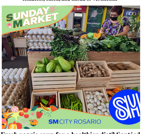
Craving for Sisig? Who knows you can make these Fresh veggie soup for a healthier diet? Sautéed SM Sunday Market fresh mushrooms into guiltless sizzling sisig? Cook these with fresh eggs, wrong! Get these freshly picked veggies every onion, garlic, and lots of chili for a more