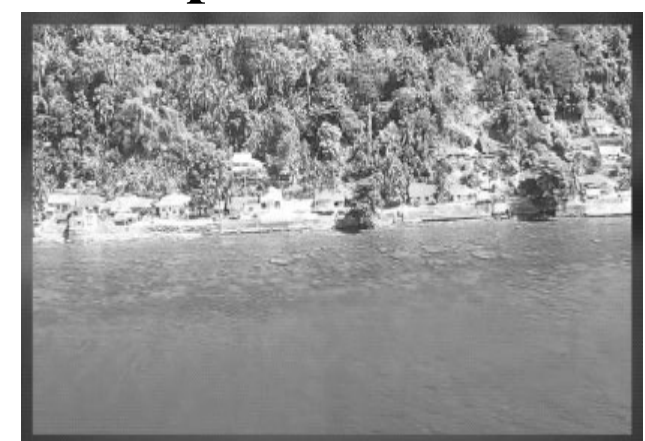
Verde Island Passage

Displaced Workers Assistance for Individuals in Crisis Situations (DSWD – AICS), among other government funds for