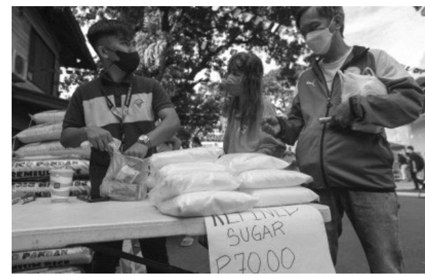
CHEAP SUGAR. White sugar is sold for PHP70 per kilo in a Kadiwa ng Pangulo center in this undated photo. The Kadiwa ng Pangulo pop-up stores remove middlemen in the movement of agricultural products from farms to consumers, allowing food and agricultural products to be sold at cheaper prices. (File photo)

The PCO said selling the seized sugar at a lower price was the best option available. "Ang Kadiwa Center ay programa ng