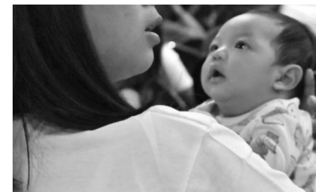
FOCUS ON YOUTH. As the country finally sees progress in the teenage pregnancy rate problem, the Commission on Population said it will dedicate its time to focus on the welfare of young parents as well as educating the teenagers of their responsibility in nation building. The agency said there was a 10 percent decrease of young mothers in 2020 compared to their 2019 data.

"These macrolevel numbers are easy to quantify, but for our young parents, their losses may be incalculable in terms of lost opportunities or missed chances. Ito po ang dahilan kung bakit sinusulong ko ngayong ang panukalang batas na ito (This is the reason why I am