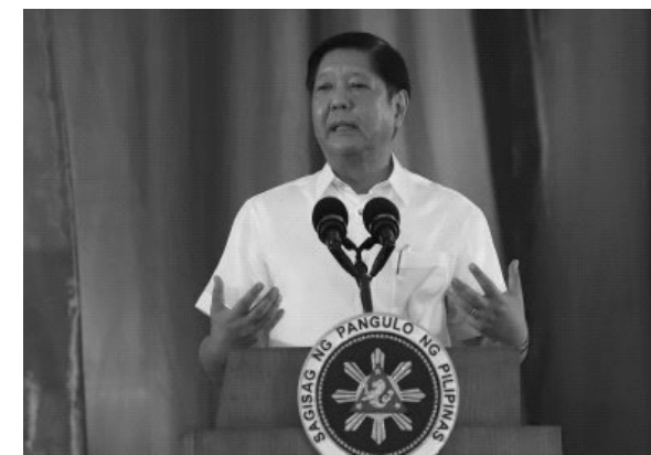
President Ferdinand R. Marcos Jr. (file photo)

production to increase, farmers and their respective cooperatives and associations (FCAs). He acknowledged that there are still a few major challenges that