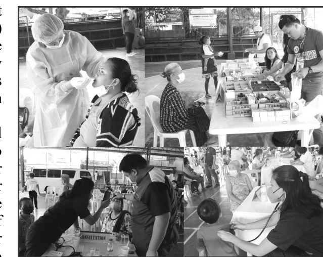
Cavite Provincial Government through the Office of the Provincial Governor — Extension in partnership with the Provincial Health Office (PHO), organized another medical mission in the City of Dasmariñas, this time in Barangay San

Also backing Hontiveros' call on concerned agencies to implement the measures, such as the inclusion of age-appropriate sexuality education curriculum in all schools nationwide, POPCOM also calls for proper information on sexual and reproductive health that should be readily made available to teenagers 15 years old and beyond.