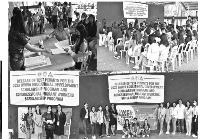
The Provincial Public Employment Service Office (PPESO) in partnership with Overseas Workers Welfare Administration (OWWA) spearheaded the Release of Test Permits for the 2023 OWWA Educational Development Scholarship Program and Congressional Migrant Workers Scholarship Program recently at the Provincial Capitol Grounds, Trece Martires City.