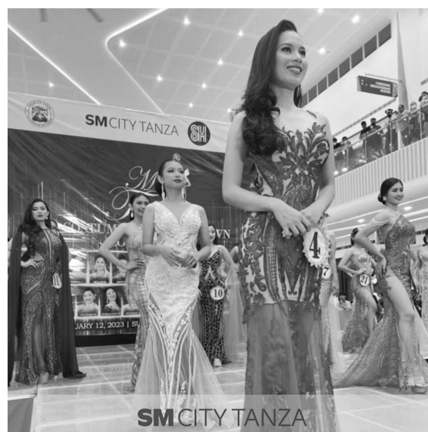
Mutya ng Tanza Candidates stun Tanzeño at SM City Tanza

Candidates from Mutya ng Tanza walked the runway with glam and elegance at SM City Tanza during its pre-pageant, showcasing the works of local designers. Mutya ng Tanza is annually held in connection with the celebration of Tanza Day. Since SM City Tanza is now open, it is the perfect venue for such an event. Catch them on the coronation night on February 24 at the mall event center of SM City Tanza.