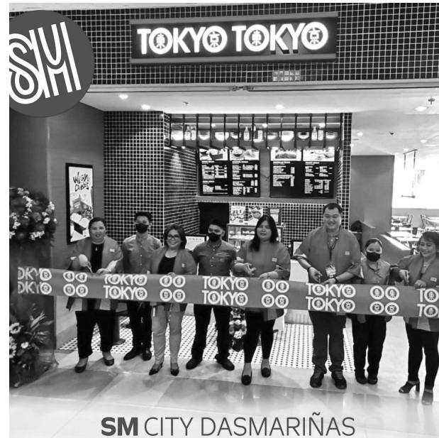
Tokyo Tokyo is back at SM City Dasmariñas! Serving you again with high-quality Japanese food is the newly refreshed Tokyo-tokyo at SM City Dasmariñas! Dine-in now at Upper Ground Level - near H&M.

Candidates from Mutya ng Tanza walked the runway with glam and elegance at SM City Tanza during its pre-pageant, showcasing the works of local designers. Mutya ng Tanza is annually held in connection with the celebration of Tanza Day. Since SM City Tanza is now open, it is the perfect venue for such an event. Catch them on the coronation night on February 24 at the mall event center of SM City Tanza.