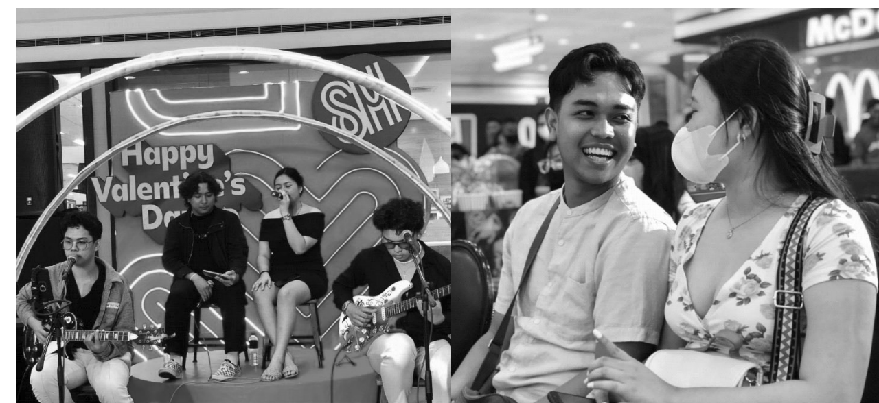
The Sweetest Valentine's is here at SM City Trece Martires! Shoppers were serenaded with love songs this Valentine's Day by the band, The Slem!

MANILA - State-run Philippine Health Insurance Corp. (PhilHealth) is empowered to choose which health care provider may be accredited under its programs, including whether to restore the revoked accreditation of firms, the Department of Justice (DOJ) said. In a seven-page legal opinion recently made available, Justice Secretary Jesus Crispin Remulla said "PhilHealth has the discretion to permanently revoke the accreditation of a health care provider or to