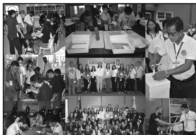
PGC employees elects PGCEA's new set of officers. Last January 9, 2023, the Provincial Government of Cavite Employees Association (PGCEA) held its first election for the new set of officers at the Ceremonial Hall, Provincial Capitol Building, Trece Martires City.

Forty-five out of 59 barangays have been