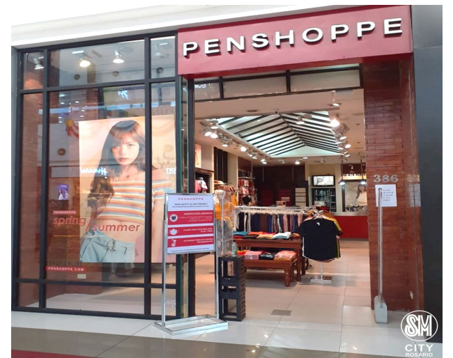
Get the latest fashion from Penshoppe