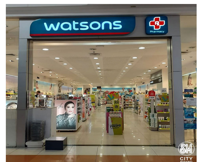
Get your essential self-care from Watsons