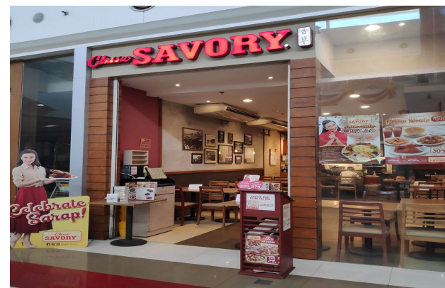
Satisfy your Chinese food cravings at Classic Savory