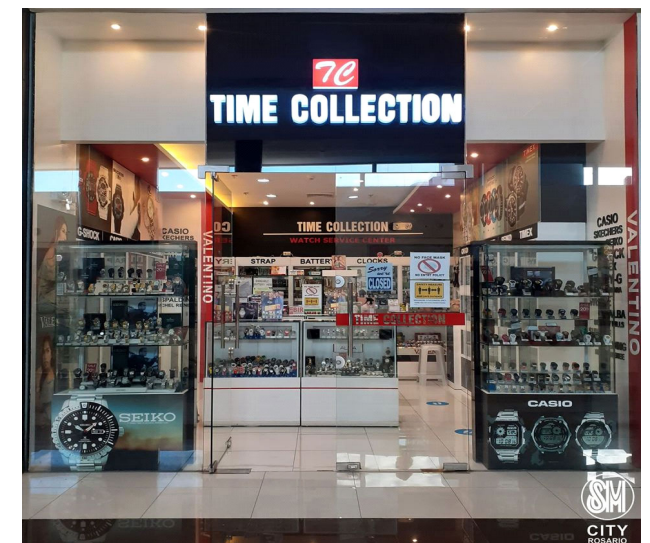
Don't be late! Hurry, get beautiful watches from Time Collection