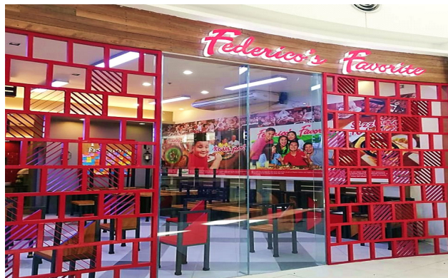
Favorite home dishes from Federico's Favorite

With the many options of convenience the mall provides, SM City Rosario is only getting started. Ushering a new era of customer experience, the mall will continue to provide safe and efficient solutions for the benefit of its shoppers. For more information on the SM Rosario Center Concierge, follow SM City Rosario on Facebook and Instagram.