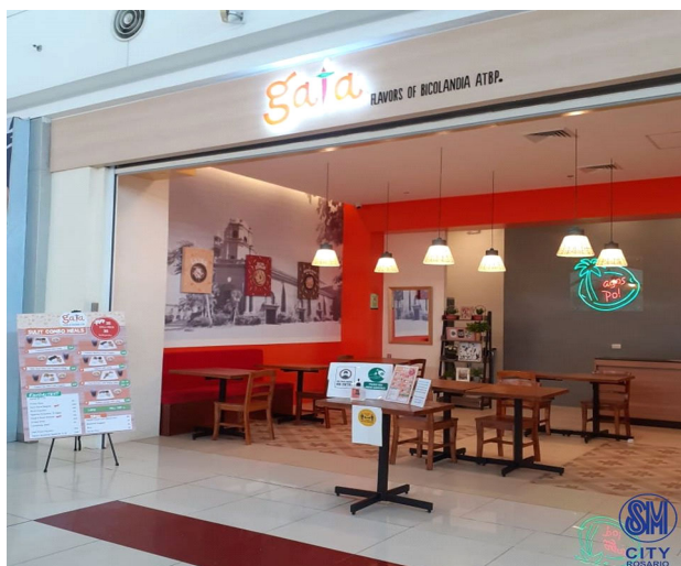
Get authentic Bicolano dishes from Gata Flavors