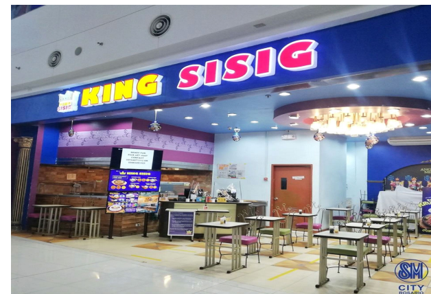
Get irresistible sisig only from the King, King Sisig!