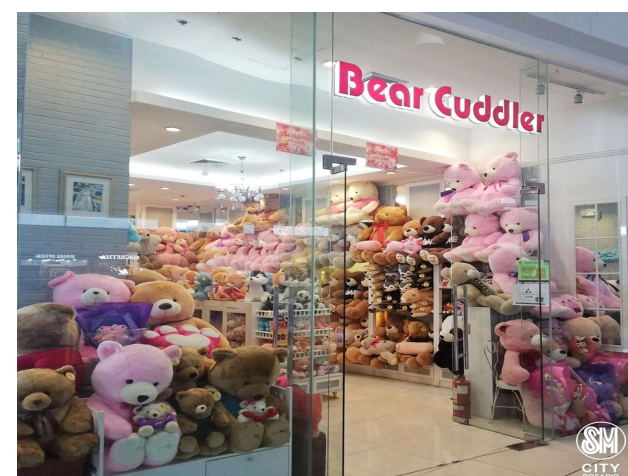
Huggable bears are waiting for you at Bear Cuddler