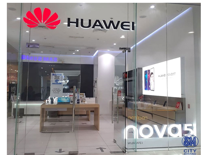
Get connected using Huawei handsets