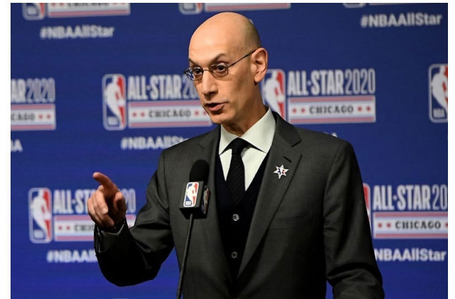
NBA Commissioner Adam Silver speaks to the media during a press conference at the United Center in Chicago, Illinois. The NBA says that players who decline to play in the restarted season in Florida next month must let their clubs know by June 24, 2020 and will face having their pay docked by up to 14 games. ESPN.com reported that the NBA Players Association informed its members on June 16, 2020 that they have until June 24 to make a decision whether to take part in the games at the Walt Disney World resort in Orlando, Florida.

The Lakers backup center Howard told CNN that now is not the time to resume basketball in light of the protests that broke out across the US following the death of George