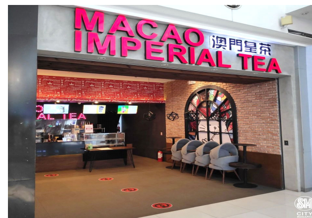
Refreshing drinks from Macao imperial Tea