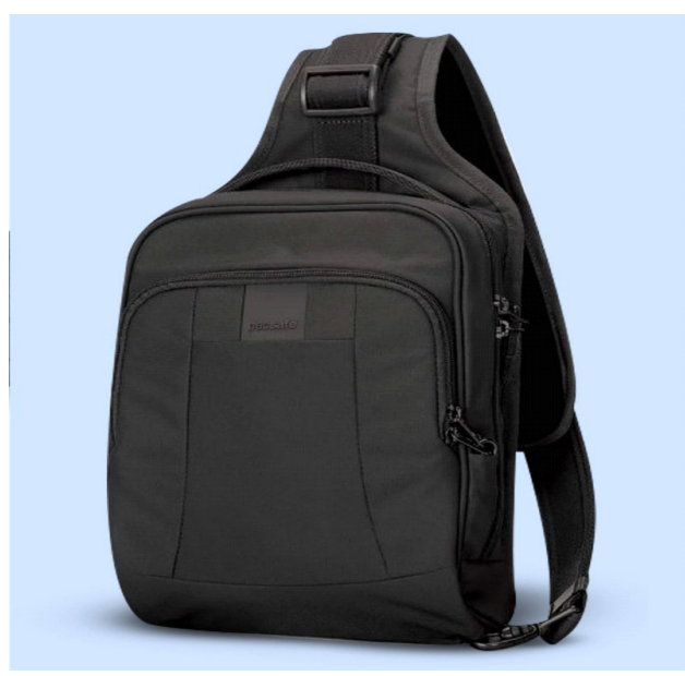
Keep your dad's gadgets secure and safe with this Pacsafe sling pack.