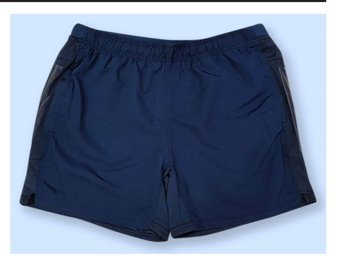
Dri-fit shorts for your dad's work out from home or home training sessions

The GoPro Hero Max Action Camera is not only waterproof, but also lets you shoot footage in a 360-degree angle too.