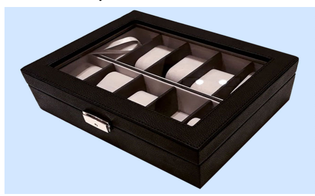
Sleek organizers for your dad's favorite watch collection.

• A Gift of Fashion and Fitness. A nice pair of rubber shoes, tees, shirts and dri-fit shorts for your dad's work out from home activity.