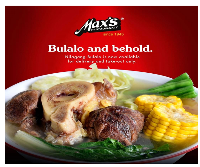
Mainit-init na Nilagang Bulalo mula sa Max's Restaurant