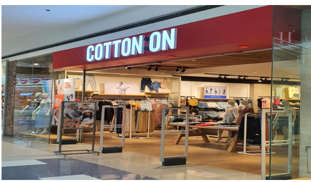
Get fashionable OOTD from Cotton:On