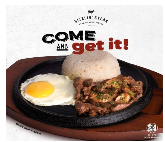
Sizzling Beef Salpicao from Sizzling Steak