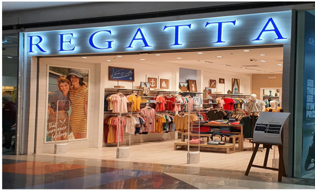
Feel good with clothes from Regatta