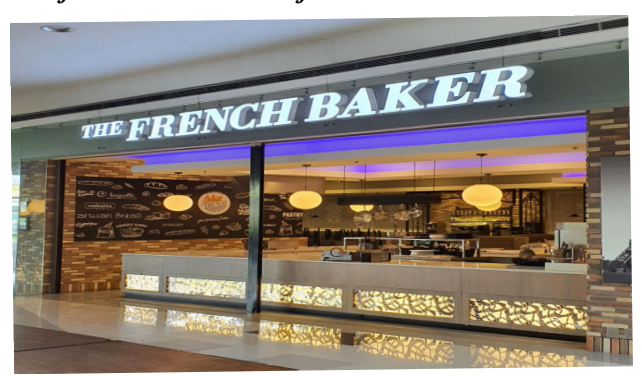
Grab and bite delicious breads from French Baker