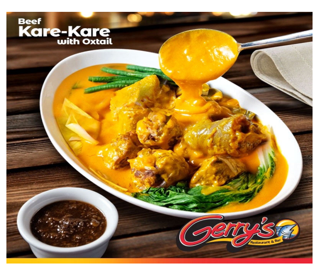
Delightful Beef Kare Kare with Oxtail from Gerry's Grill

Enjoy the restaurant experience at home with SM City Trece Martires To-Go service.