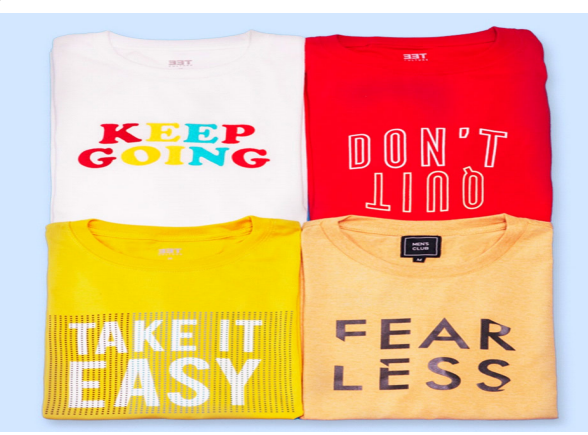
Inspo Statements Tee for dads.

The GoPro Hero Max Action Camera is not only waterproof, but also lets you shoot footage in a 360-degree angle too.