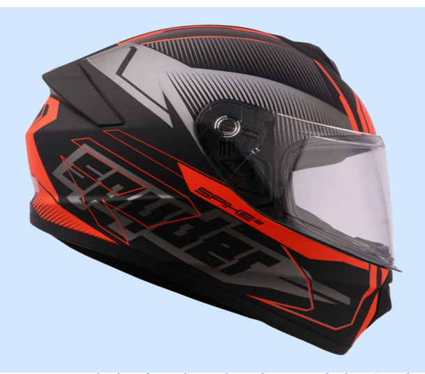
Keep your dad safe as he rides along with this Spyder, Spike Helmet.

• A Gift of Cool. Keep Dad safe with smart and protective helmets as his takes his ride.