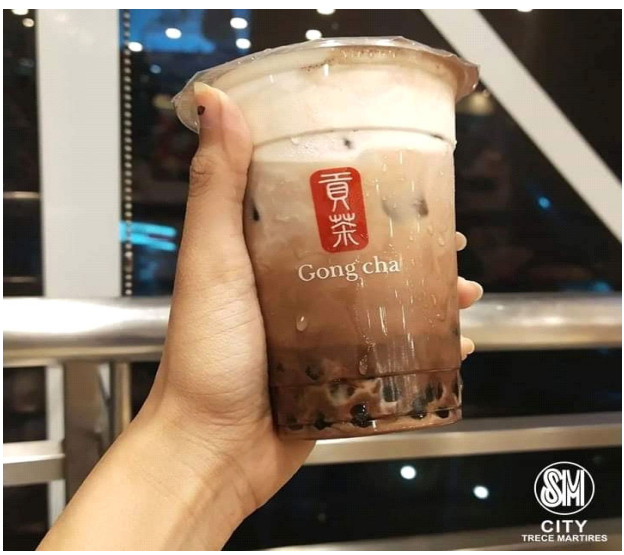
Refreshing Milk Tea from Gong Cha