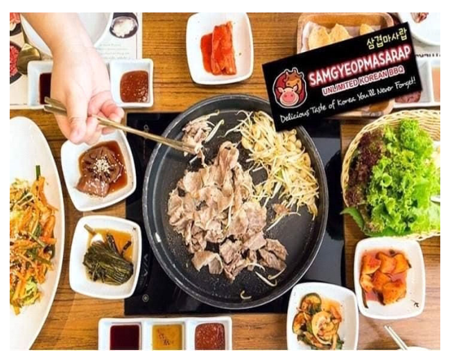
Have a taste of Korea with Samgyeopmasarap