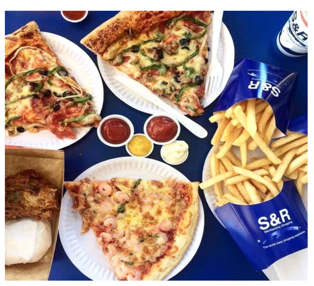
Get your favorite pizza and fries from S&R New York Style Pizza