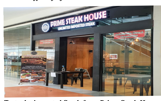
Taste the imported Steak from Prime Steak House