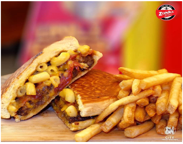
Mouthwatering Thunder Mac 'N Cheese with Fries from Zark's Burger