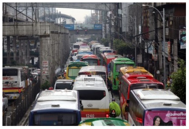
EDSA BUSES. Public utility buses fill the streets of Edsa before the coronavirus disease 2019 pandemic hit the country. The Department of Transportation on Wednesday said three more city bus routes will open by Thursday, bringing the total active city bus routes in the region at 20.

These active routes include a portion of the Edsa Carousel route which augments the Metro Rail Transit Line