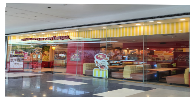
Get authentic Bacolod Inasal Chicken from Bacolod Inasal

Concierge With the many options of convenience the mall provides, SM City Dasmariñas is only getting started. Ushering a new era of customer experience, the mall will continue to provide safe and efficient solutions for the benefit of its shoppers. For more information on the SM Dasmariñas Center Concierge, follow SM City Dasmariñas on Facebook and Instagram.