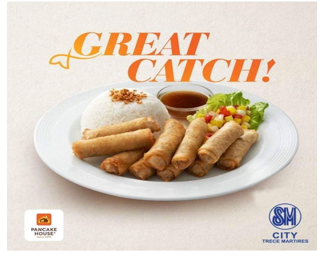
Great catch with this Fish Rolls from Pancake House