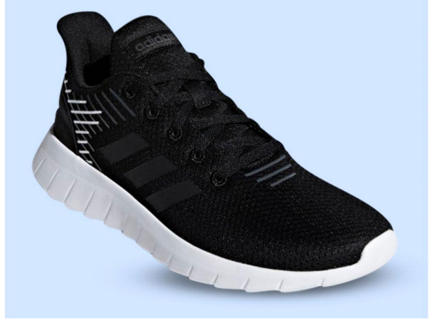
Adidas Rubber Shoes for your dad's fitness routine from home