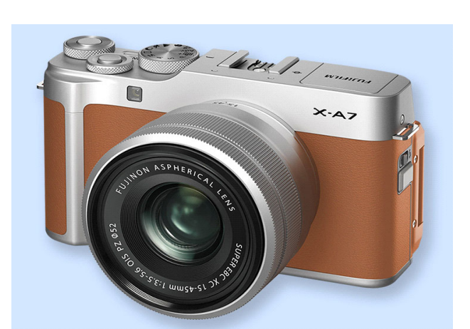
Dads will love this Fujifilm X-A7 Mirrorless Digital Camera that lets him shoot pro-level photos and videos.

• A Gift of Memories. Whether capturing family's best moments or his new norm adventures, dads will surely love a new gadget like the FujiFilm Mirrorless Digital Camera or Go Pro Hero Max Action Camera.