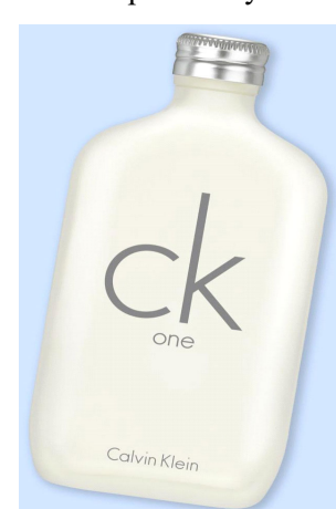
Calvin Klein Eau de Toilette

• A Gift of Cool. Keep Dad safe with smart and protective helmets as his takes his ride.