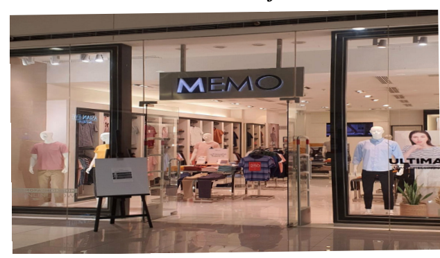
Wear comfy outfit from Memo