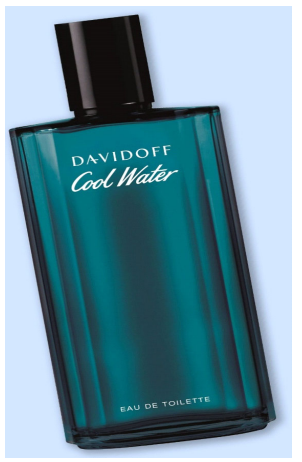
Davidoff Cool Water scent

• A Gift of Scent-sibility. Either a new scent or his signature scent will add zest to his special day.