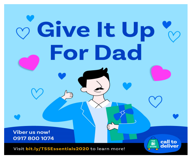
Make Dad feel special this Father's Day with SM's Call to Deliver.

Whether being homebound together has made you appreciate Dad more, or you've been missing him as boundaries separate, make him feel special with The SM Store's Father's Day Gift Essentials and have them delivered to him on his very special day through #SMCalltoDeliver!