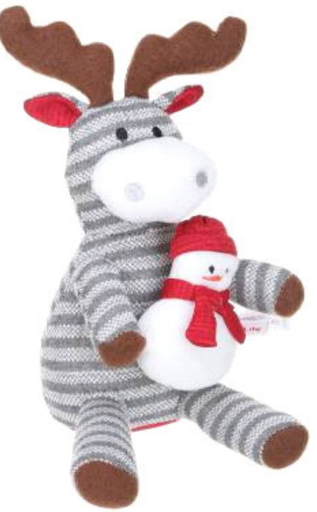
Cuddly sitting moose plush toy from Miniso.