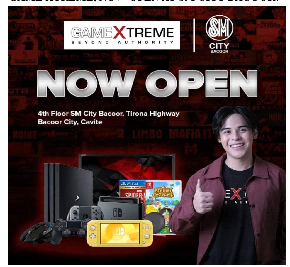
SM CITY BACOOR, CAVITE - Good news, gamers! GameXtreme is NOW OPEN at SM City Bacoor! Visit us today at the 4th floor Cyberzone, and shop for your ultimate gaming essentials and gadgets from GameXtreme! See you there!

Follow our social media accounts and website for more updates: