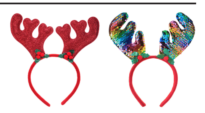
Fashionable reindeer headbands for your mini Christmas parties.

These penguin plush toys are wonderfully wintry