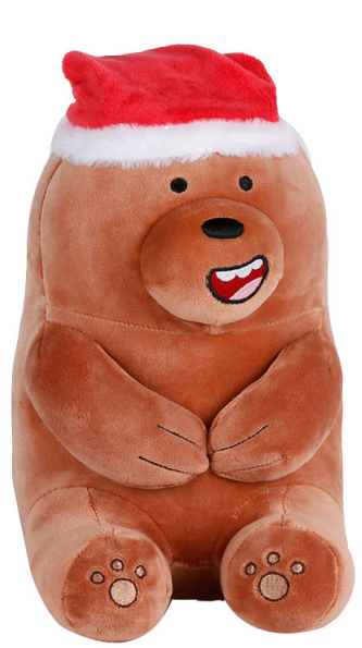
We Bare Bear's Grizzly wearing a Santa hat for the holidays