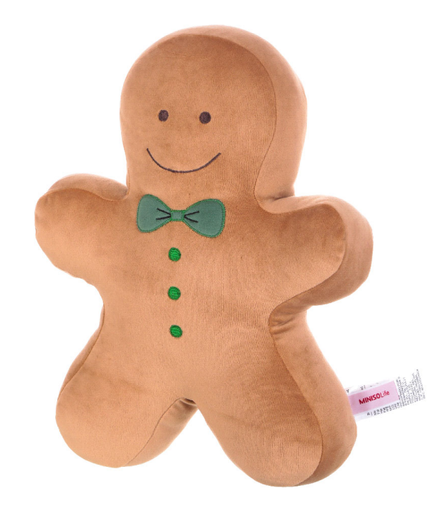
Gingerbread plush toy to have and to hold. Available at Miniso.

Conveniently shop your Christmas gifts now at shop.minisoph.com and instantly place your orders! All these and more are also available at Miniso stores located in most SM Supermalls nationwide. For more details and updates, you can check out Miniso Philippines at Facebook and Instagram.