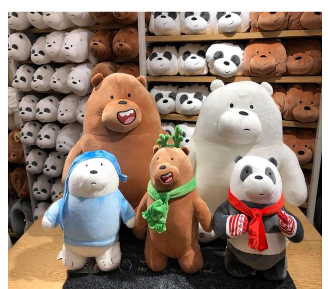
Huggable and adorable Christmas inspired plush toys now available at Miniso.

It's the most wonderful time of the year at Miniso as it brings you quality and affordable gift ideas perfect for the holiday season.