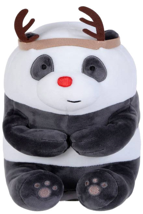
This cute and lovable Panda from We Bare Bears sports his reindeer look. Available at Miniso.

It is the blessing of Jehovah that makes one rich,And He adds no pain with it. Proverbs 10:22