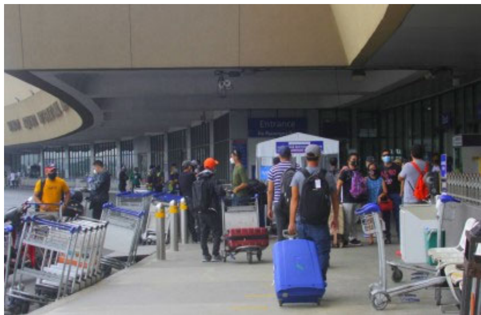
Ninoy Aquino International Airport Terminal 1 (File photo)