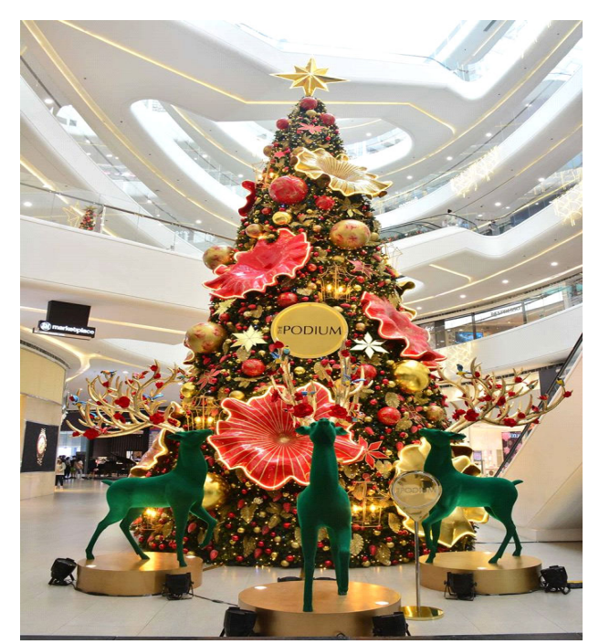
With its Holiday Blossoms theme, The Podium's 40foot tree is adorned by giant red and gold lotus leaves, Christmas balls, and lanterns. It is surrounded by reindeer with intricate antlers.