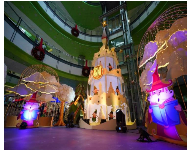
SM City Sucat's A Magical Christmas Tale centerpiece features a 20-foot castle themed Christmas tree, which glows with pages from a storybook, and has well-loved fairy tale characters on each side.