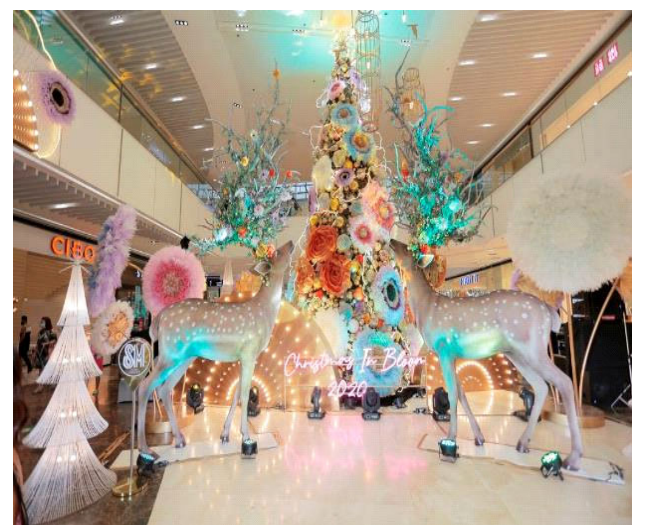
Christmas is in bloom at SM Aura Premier with its centerpiece signifying the first blossoms of spring as a symbol of hope. Designed in pastel and spring colors, the tree blooms with giant flowers and filled with crystalized Christmas balls in bronze, silver, and white. The tree lights up with fan shaped LED lights,

Since that time, the Christmas tree has found its place in many Filipino homes. Beyond the display and the ornaments, it has conveyed a message of love, unity, and joy in every member of the family.