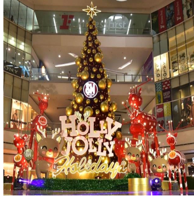
It's a Holly Jolly Christmas at SM City North EDSA with a towering 40-foot Christmas tree glittering in wine red tinsel and covered with shimmering gold ornaments. Playful artisan sculpted reindeer surrounding the tree awaken the child in us that cherish and rekindle the warmth and joy this season brings.

white. The tree lights up with fan shaped LED lights, and is accented by 2 giant reindeer beautifully dressed up with floral horns.