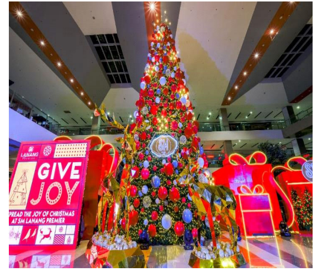
Embellished with crystals and twinkling lights, SM Lanang Premier's 57-foot Christmas tree glows in classic Christmas colors of red, white, and gold. This festive holiday centerpiece symbolizes and overflow of hope and cheer, inspiring shoppers to give joy and celebrate life amid challenging times.