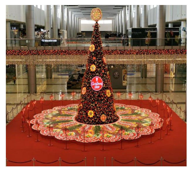
SM City Clark's Parul Kapampangan centerpiece is a tribute to Pampanga's lantern making industry. The dazzling 45- foot tree with 1,680 bulbs and spinning lights is proudly designed and assembled by Kapampangan parol makers

white. The tree lights up with fan shaped LED lights, and is accented by 2 giant reindeer beautifully dressed up with floral horns.