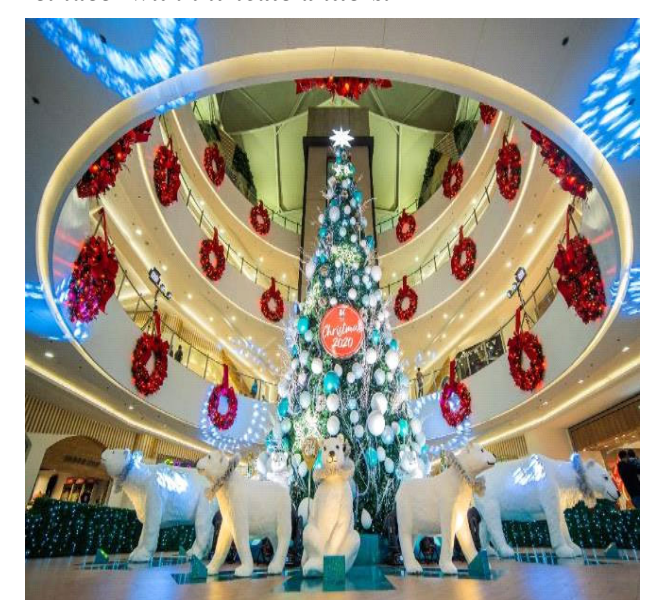
SM City Baguio's Winter Wonderland spectacle features a 35-foot tree with snow-capped pine cones, sparkling snowflakes, and glimmering garlands surrounded by adorable polar bears. Built by the artistry of local craftsmen, it celebrates Baguio as the cradle of creative culture and traditions.