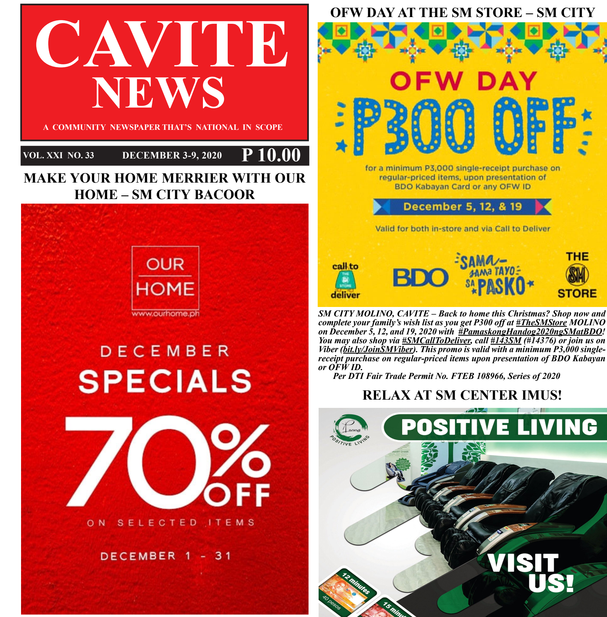
SM CITY BACOOR, CAVITE - It's the season to be merry! Don't let your home be dull this Christmas so you and your family can feel the holidays especially now that everyone is at home! Enjoy up to 70% off on OUR HOME specials from Dec 1-31! Hurry and find Great Designs at Great Prices. Visit Our Home at the 2<sup>nd</sup> level of SM City Bacoor today! Per DTI Fair Trade Permit No. FTEB 109710, series of 2020.