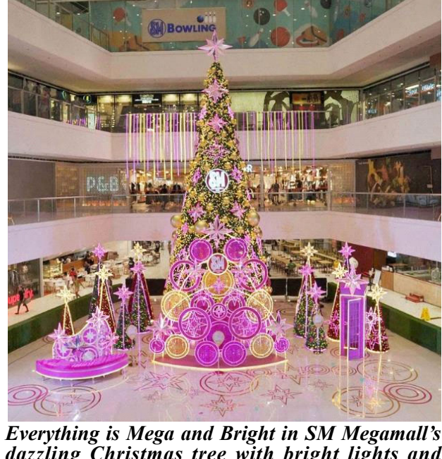
dazzling Christmas tree with bright lights and sparkling ornaments. The gold and fuchsia palette is carried on to the giant Santa Chair with stars upholstered in pink satin, and a telephone booth accented with stars and pink fairy lights.