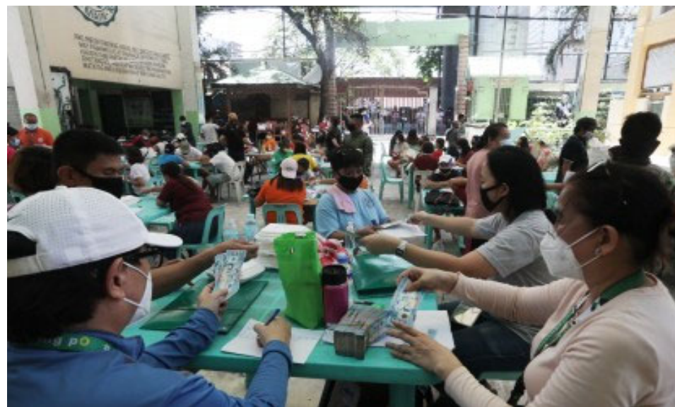
BEATING THE DEADLINE. Personnel from the Parañaque City government distribute cash aid as part of the Social Amelioration Program to around 859 beneficiaries at the Tambo Elementary School on Monday (May 4, 2020). The Department of the Interior and Local Government has given local officials in Metro Manila until May 10 to complete the distribution of the first tranche of the cash aid.