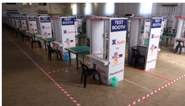
SWAB TEST FACILITY. The swab test booths set up at the Palacio de Maynila along Roxas Boulevard in Manila. Health Sec. Francisco Duque III said the swab test facilities would help ramp up the country's testing capacity for Covid-19.

Bases Conversion and Development Authority (BCDA)