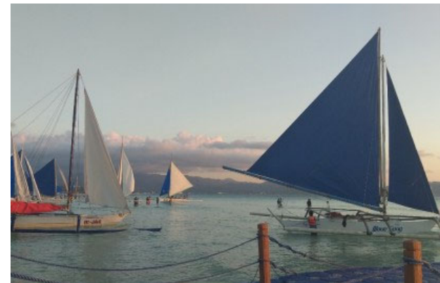
Boracay (File photo)

"Safety before anything else and we need collective efforts to really flatten the curve. Time will come when the tourism activities will go back to normal," he said.