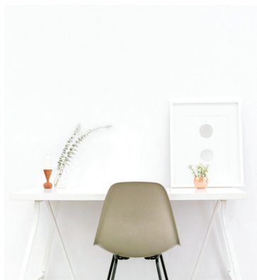
Designate a well-lit area which is conducive to learning that helps your child focus.