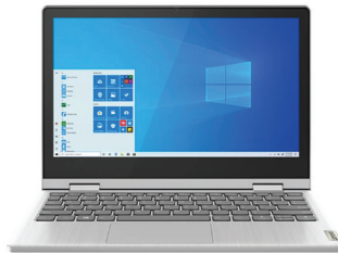
Master online classes with the Lenovo Ideapad3 series.