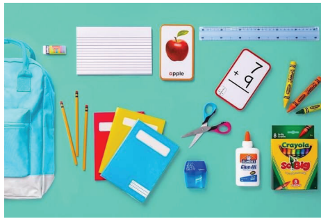
SM Stationery has the wide variety of homeschool supplies for your needs. Call #143SM to Order.