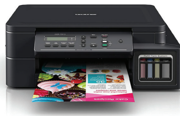
Use this Brother inkjet multi-function printer for all your printing needs.