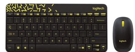
Go wireless with this Nano Wireless keyboard and mouse combo.