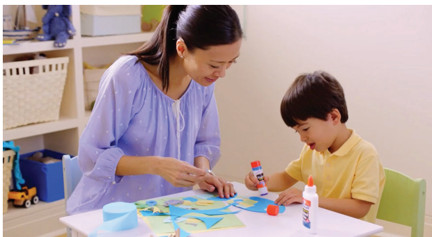
Homeschooling sparks creative learning and fun parenting that must go hand in hand.

SM Stationery and Gadgets Hub is now online on www.smstationery.com.ph and with the SM Store's #143SM Call to Deliver services. You can now have your homeschool must-haves delivered right to your doorstep. Follow SM Stationery PH in Instagram and Facebook and join their Viber community for more details and info.