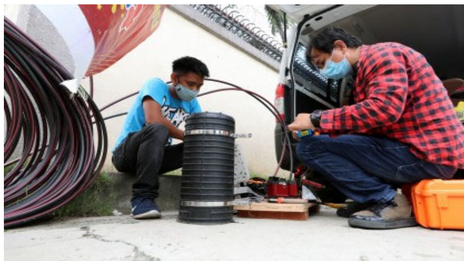
MORE FIBER LINES. A broadband service team works on PLDT's fiber line in this undated photo. The PLDT on Wednesday (Oct. 21, 2020) announced plans to roll out more fiber lines in the next three to six months to meet the country's growing demand for faster internet services.