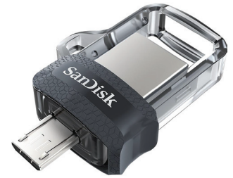
Save files in mobile or with your PC with Sandisk OTG Ultra Dual USB Drive.