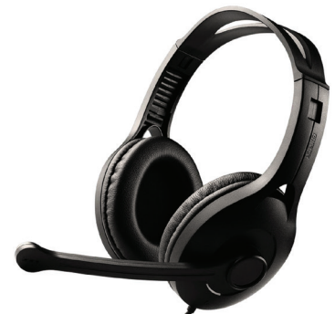
Easy to Plug and Play Edifier K800 Headset with adjustable head bands and foam ear cups for comfort fit