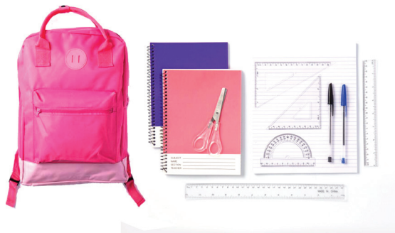
Keep your kids busy and stay smart with the right homeschool supplies in this All-in-One School backpack.