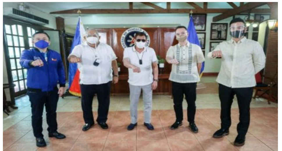
PRRD MEETS WITH HOUSE LEADERS. President Rodrigo Roa Duterte gestures as he poses for a group photo with Senator Christopher "Bong" Go, Executive Secretary Salvador Medialdea, Taguig-Pateros Rep. Alan Peter Cayetano, and newly-installed House Speaker Lord Allan Velasco following a meeting held at the Malacañang Golf Club (MALAGO), Malacañang Park, Manila Tuesday (Oct. 13, 2020). Malacañang expressed confidence that the lower chamber can pass the proposed 2021 national budget by Oct. 16.

“I may consider the proposal of employers, I will ask Secretary (Carlos) Dominguez of the Department of Finance with the help of my partner Secretary (Ramon) Lopez of the Department of Trade and Industry and try to