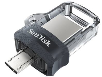
Save files in mobile or with your PC with Sandisk OTG Ultra Dual USB Drive.