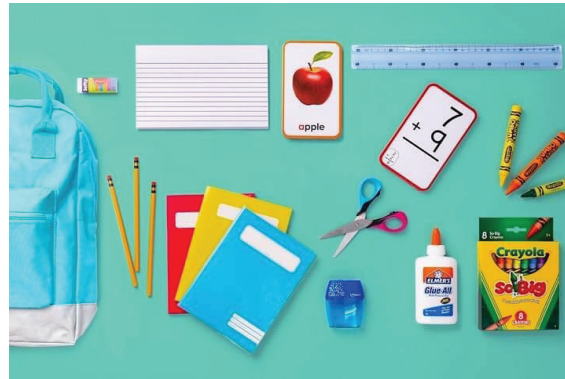
SM Stationery has the wide variety of homeschool supplies for your needs. Call #143SM to Order.