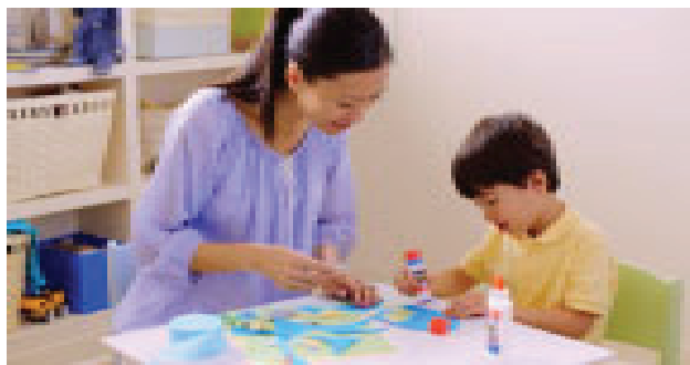
Homeschooling sparks creative learning and fun parenting that must go hand in hand.

SM Stationery and Gadgets Hub is now online on www.smstationery.com.ph and with the SM Store's #143SM Call to Deliver services. You can now have your homeschool must-haves delivered right to your doorstep. Follow SM Stationery PH in Instagram and Facebook and join their Viber community for more details and info.