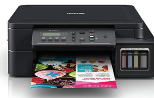
Use this Brother inkjet multi-function printer for all your printing needs.