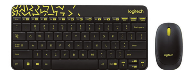
Go wireless with this Nano Wireless keyboard and mouse combo.