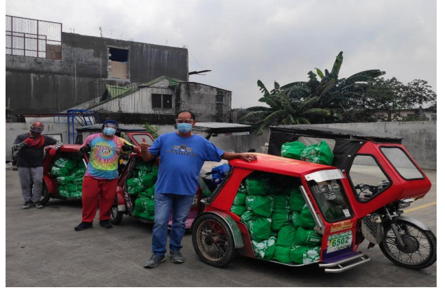
The smiles behind the masks of these drivers from Patindig Araw - Bucandala SM Toda joyfully posing with their Tricycles full of 300 Kalinga Packs for their fellow drivers