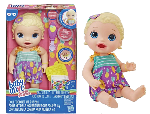
Little girls will surely love playing with Baby Alive Blonde Snackin' Lily Super Snacks Doll. Available for only Php 800.00.

As one of the leading toy stores in the Philippines and the largest toy store chain in the Asia- Pacific region, Toy Kingdom continues to deliver its mission of providing amazing childhood for kids and creating lasting memories for families even during these trying times.