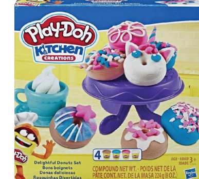
Play Doh's Kitchen Creations Delightful Donuts set for little foodies. Available at Toy Kingdom for only Php 449.78.

UBP Online, GCash and Grabpay. Toy Kingdom also has guaranteed delivery services and 15 days return for online purchases. They also have various in store and online promos available. For more details you can now check out and shop your toy essentials at www. Toykingdom.com.ph. You can also like @toykingdomPH at Facebook and follow @ToykingomPH at Instagram for amazing toy updates.