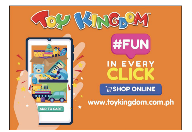
Shop for the most amazing stay at home toys for your kids at Toy Kingdom's newly launched online shopping website-<u>www.toykingdom.com.ph</u>.

Kids and kids at heart can now enjoy an amazing shopping experience with Toy Kingdom's recent launching of its very own shopping website- www. toykingdom.com.ph.