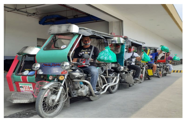
Tricycle drivers from Transport Groups of SM City Rosario Terminal happily received Kalinga Packs from SM Foundation and SM City Rosario.

1, Lot 12, Blk. 21, Camachille I, Gen. Trias City, Cavite 2, Lot 4, Blk. 14, Purok Silangan, Brgy. Dela Paz, Antipolo City