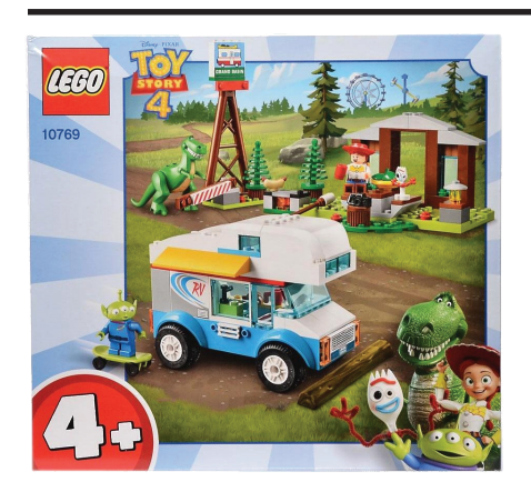
Kids will have fun and also improve their constructive skills with Lego's Classic Disney Pixar Toy Story 4 RV Vacation Building Blocks for only Php 3,399.75.