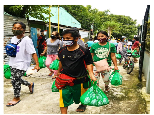
Happy residents of Brgy. Alapan 1C who were among the 94 family beneficiaries who received Kalinga packs with Rice and Grocery items last August 18, 2020