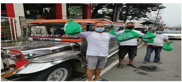
Almost 300 excited Jeepney drivers receiving Kalinga packs from SM City Trece Martires.