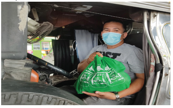
The hope in the eye of a Jeepney driver receiving his Kalinga Pack as assistance to the families affected by the suspension of Public Transportation.