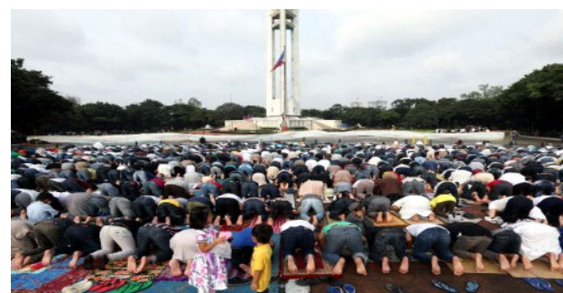
EID'L ADHA. Filipino Muslims say their prayers in celebration of Eid'l Adha or the Feast of Sacrifice at the Quezon City Memorial Circle in this file photo. Republic Act 9849 says the declaration of Eid'l Adha as regular holiday allows Muslims to "pay homage to Abraham's supreme act of sacrifice and signifies mankind's obedience to God."

Republic Act 9849 states that Eid'l Adha,