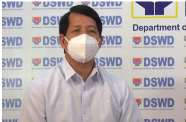
Department of Social Welfare and Development (DSWD) Secretary Rolando Joselito Bautista

Bautista said they have provided cash aid