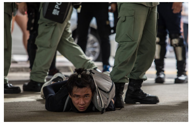
Riot police detain a man as they clear protesters taking part in a rally against a new national security law in Hong Kong on July 1, 2020, the 23rd anniversary of the city's handover from Britain to China.

"If the British side makes unilateral changes to the relevant practice, it will breach its own position and pledges as well as international law and