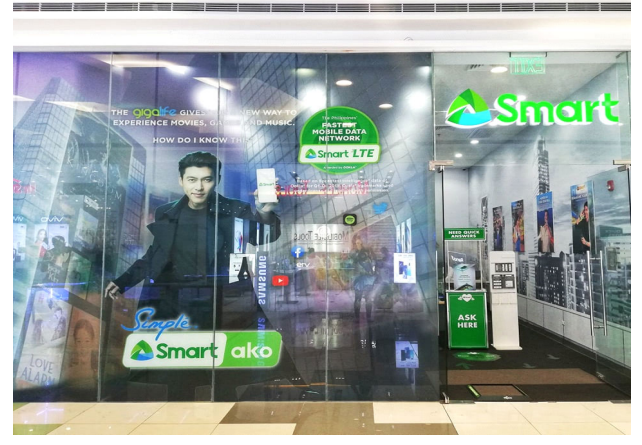
Experience excellent service for your mobile and for your communications need from SMART.

Japan is currently in its rainy season, which often causes floods and landslides and prompts local authorities to issue evacuation orders.