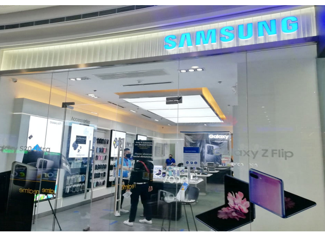
Shop and discover the latest smartphones from SAMSUNG.

With the many options of convenience the mall provides, SM City Rosario is only getting started. Ushering a new era of customer experience, the mall will continue to provide safe and efficient solutions for the benefit of its shoppers. For more information on the SM Rosario Center Concierge and Cyberzone, follow SM City Rosario on Facebook and Instagram.