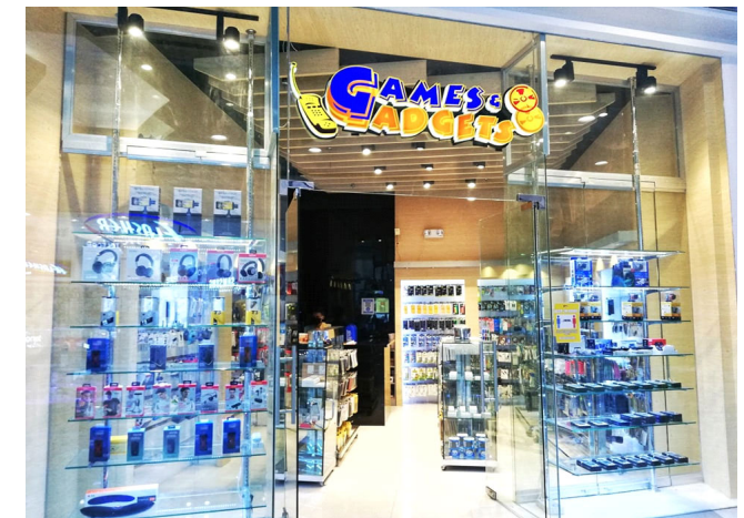
Enhance your gadgets by adding accessories to them at GAMES and GADGETS