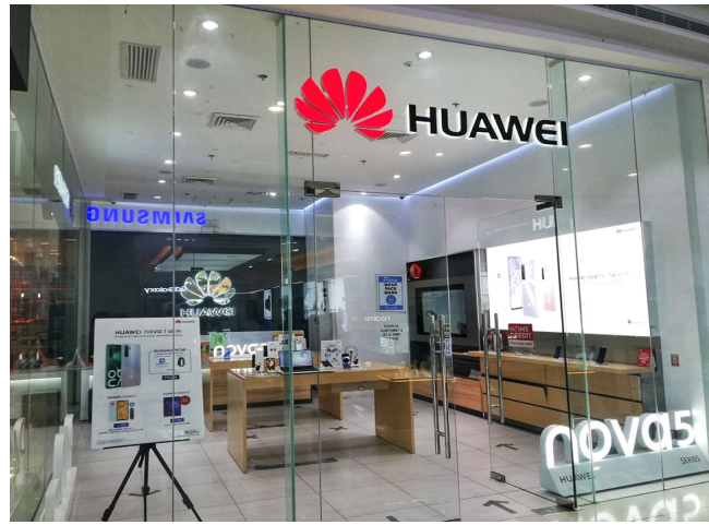
Explore great range of products including mobile phones, tablets, watches and wearables at HUAWEI