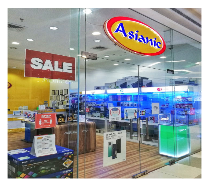
Get your new normal essentials for work and for school from ASIANIC