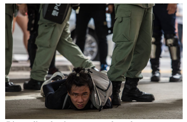
Riot police detain a man as they clear protesters taking part in a rally against a new national security law in Hong Kong on July 1, 2020, the 23rd anniversary of the city's handover from Britain to China.

"If the British side makes unilateral changes to the relevant practice, it will breach its own position and pledges as well as international law and