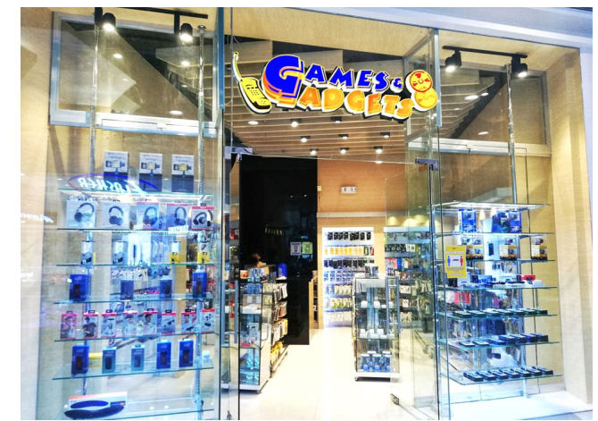
Enhance your gadgets by adding accessories to them at GAMES and GADGETS