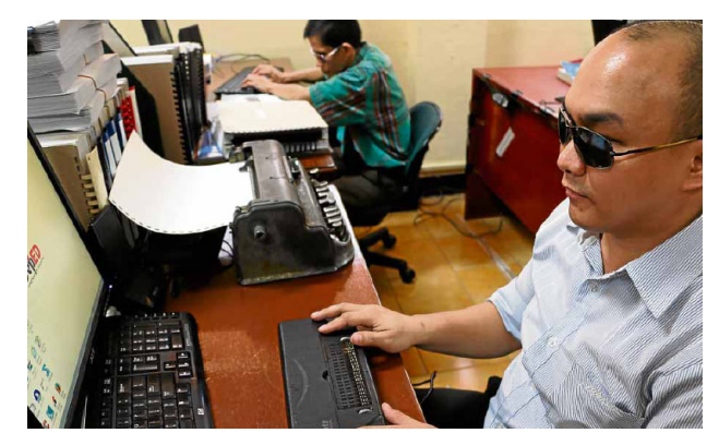
DSWD has allocated P100,000 for assistive devices for each DSWD Field Office every year. starting this year. According to DSWD. These devices may include talking laptops and tablets, talking canes/smart canes, and Braille system for the blind and visually impaired, among others.

These devices may include talking laptops and tablets, talking canes/smart canes, and Braille system for the blind and visually impaired; hearing aids with beamforming technology, customized headphones, and Cochlear implant for deaf and hearing impaired; motorized wheelchair, customized wheelchair. triwheelchair bike, talking watch, customized artificial eyes, and neuroprosthesis for the orthopedically and