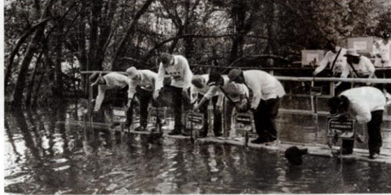
ASEAN mangrove planting and coastal clean-up in Jakarta, Indonesia.

The continuing exploitation of our biological resources and degradation of our natural ecosystems have exposed us to the full brunt of disasters that are consequences of the climate crisis, which include the spread of infectious diseases. According to the World Health Organization, climate change affects water-borne diseases transmitted through insects and cold-blooded animals, and lengthens the transmission season of vector-borne infectious diseases. Malaria, which is strongly