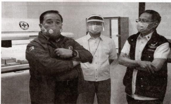
Philippine Red Cross chairman and CEO Sen. Richard J. Gordon (left) with DILG Sec. Eduardo Año (center) and DOH Sec. Francisco Duque III (right), during their visit at the PRC 2nd Molecular Laboratory in Mandaluyong City also attended by IATF Spokesperson Cabinet Sec. Karlo Nograles, DND Sec. Delfin Lorenzana and some NCR Mayors (not in photo).

"We do have a plan in the Red Cross to make sure that we are able to know the enemy. Napakahalaga na matanggalan ng maskara itong enemy na ito. We cannot win a war without knowing who the enemy is. Kaya from Day 1, inisip namin dito sa Red Cross - magtesting. Once you do that, you can isolate, after tracing, of course, sino mga dinapuan niya. Then we can start healing, and we can