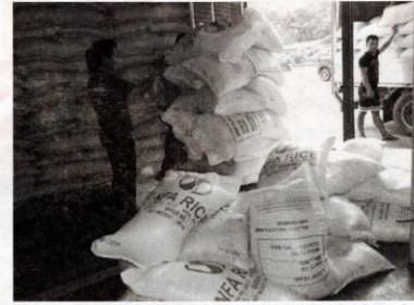
National Food Authority (NFA) had already issued a total of 2,191,733 bags of rice to various local government units (LGUs), the Department of Social Welfare and Development (DSWD), legislators, and other relief institutions, for distribution to affected families.

"I can't thank them enough and a lot of other people have donated, some in kind. We're putting all the donations together. The Ayala Group, they were the ones who retrofitted the laboratories. They put in their construction people, who are quite good in putting all the equipment together, including the negative pressure. This one was completed in five days," Gordon said. (PRC)