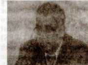
World Health Organization chief Tedros Adhanom Ghebreyesus

Tedros responded to calls by some American politicians for his resignation after US President Donald Trump accused him of being China-centric and ordered Washington stop