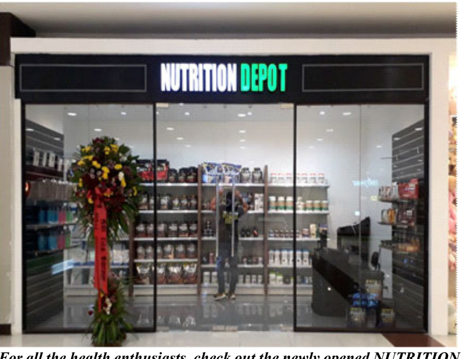
For all the health enthusiasts, check out the newly opened NUTRITION DEPOT in SM City Bacoor. It offers wide variety of international sports and body building supplements. Wide-range of products to choose from to cater your health fitness goal. Visit Nutrition Depot at the 3<sup>rd</sup> level of SM City Bacoor

"A lot of guys showed that resiliency in game two. It's going to have to continue for us to get three more wins," Curry said.