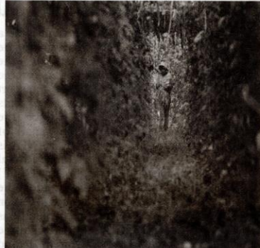
"The 'Plant, Plant, Plant Program' seeks to increase national agri-fishery output through intensified use of quality seeds, appropriate inputs, modern technologies to increase levels of productivity across all commodities.

Force for the Management of Emerging Infectious Diseases (IATF-EID) for approving the recommended P31-billion supplemental budget to fund the 'Plant, Plant, Plant Program' that seeks to increase national agri-fishery output through intensified use of quality seeds, appropriate inputs, modern technologies to increase levels of productivity across all commodities, and thus ensure food productivity, availability, accessibility and affordability amidst the threat of Covid-19 pandemic.