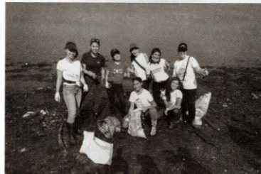
The Body Shop Philippines fighting to change the world one step at a time.