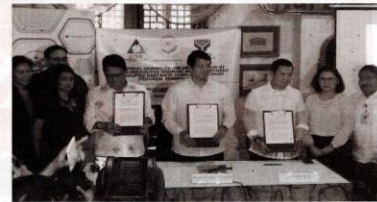
EMPLOYMENT FOR 4Ps BENEFICIARIES.

"We have to prepare them before they exit