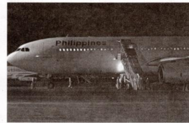
HOME. The second plane carrying another 136 repatriates from Japan arrived at 12:12 a.m. on Wednesday (Feb. 26, 2020). A total of 445 repatriates, 13 members of the DFA-DOH repatriation team, and PAL crew will be isolated for 14 days at the NCC Athletes' Village.