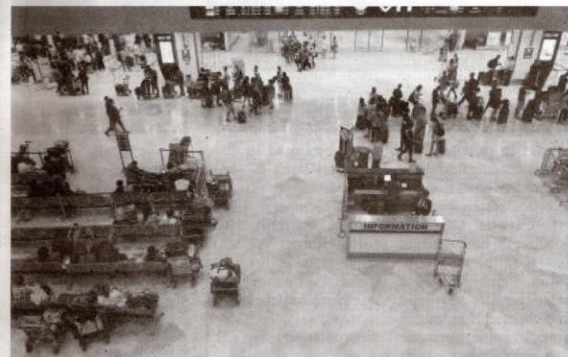
NAIA Terminal 1 (File photo)

"Kung ganun po ang proseso na meron pa po silang quarantine -- yung mga crew -- medyo mahihirapan sila na mag-mount ng flights dito kahit na meron temporary lifting ng mga pasahero papuntang Hong Kong (If that is the process, that crew members have to