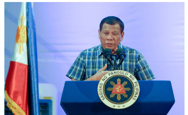
President Rodrigo Roa Duterte delivers a speech after leading the ceremonial distribution of assistance to the families affected by the Taal Volcano eruption at the Polytechnic University of the Philippines-Sto. Tomas Campus in Sto. Tomas City, Batangas on January 20, 2020.