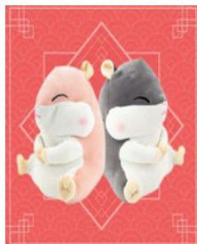
Huggable and fluffy hamster inspired plush toys to keep you company this Year of the Rat. Available at Miniso.