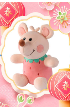
Endearing strawberry rat plush toy from SM Accessories Kids.

According to Chinese philosophy, the Rat is a symbol of prudence: an inquisitive, brisk animal that rarely finds itself in a desperate situation. The child of the Rat Year fully enjoys these positive qualities of this animal: curiosity, restraint, hard work, insight, a sharp mind, and a strong intuition.