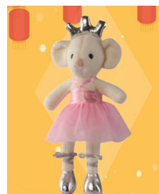
Pretty ballerina inspired rat plush toy. Available at Toy Kingdom.