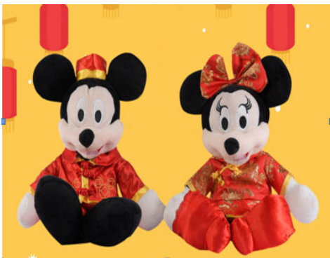
Mickey and Minnie Mouse lead the celebrations in their Chinese inspired costumes. Available at Toy Kingdom.