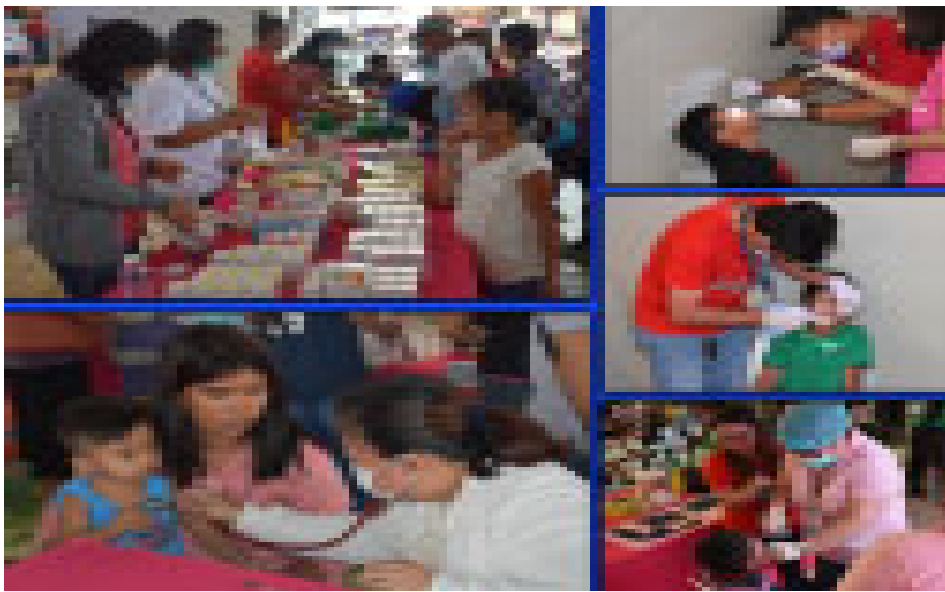
PROMOTING WELLNESS IN THE MUNICIPALITY OF SILANG: With its goal to touch the lives of its constituents and promote wellness, the provincial government of Cavite thru the Office of the Provincial Governor -Extension (OPG-Ext.) and the Provincial Health Office heightened its advocacy on fitness and health as another leg of medical and dental mission was rendered at Patio Medina Covered Court in the municipality of Silang on January 15, 2020. A total of 756 residents have been checked and availed free consultations and dental services performed by medical practitioners from General Emilio Aguinaldo Memorial Hospital. —(PICAD)