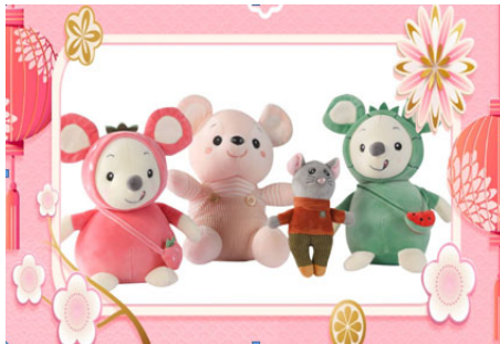
The cutest rat colony from SM Accessories Kids. Available in SM Accessories Kids department of The SM Store.