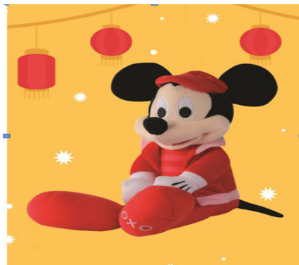
Bring home this classic Mickey Mouse plush toy for more luck in the Year of the Rat. Available at Toy Kingdom.