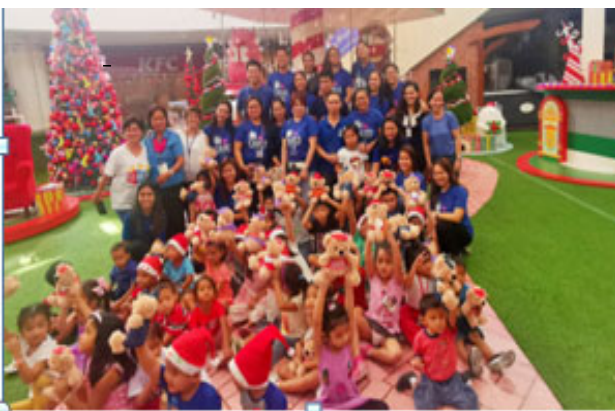
Volunteers from SM City Molino making this season merrier as they hand out Bears Of Joy to the kids