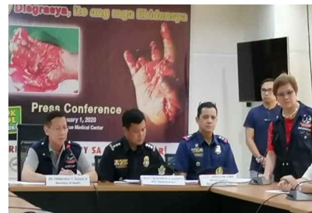
OPLAN IWAS PAPUTOK. In a press briefing on Wednesday (Jan 1, 2020), Health Secretary Francisco Duque III said the firecracker-related injuries reduced as much as 35 percent this year. From Dec. 1, 2019 to Jan. 1, 2020, the Department of Health recorded a total of 164 firecracker-related injuries, which is lower than the 251 cases reported during the same period last year.