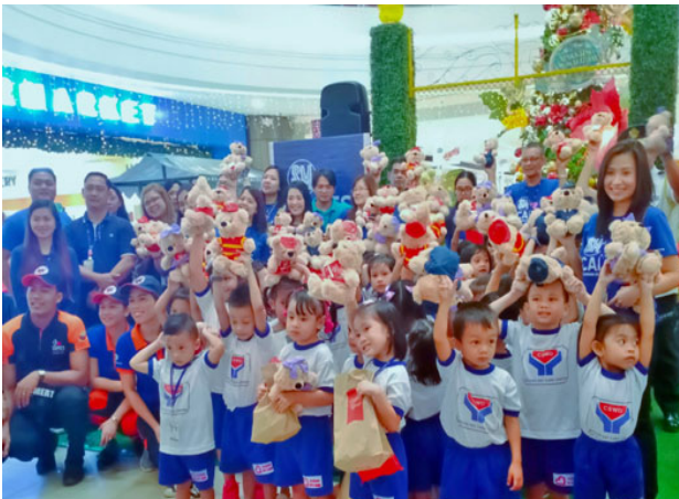
Children from Panapaan 5, Day Care Center, Bacoor City with their new cuddly friends SM Bears of Joy, and the volunteers from SM City Bacoor