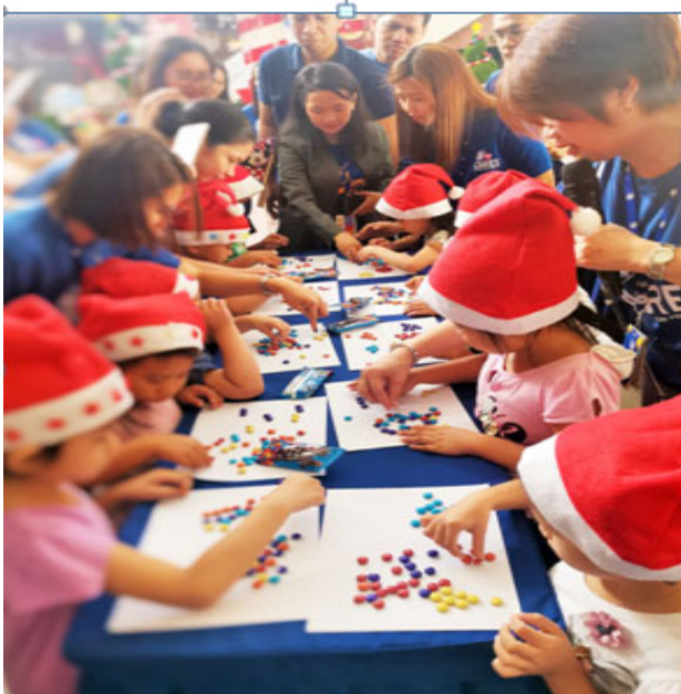
Kids from City Homes Daycare Center playing color game with SM City Molino's Volunteers