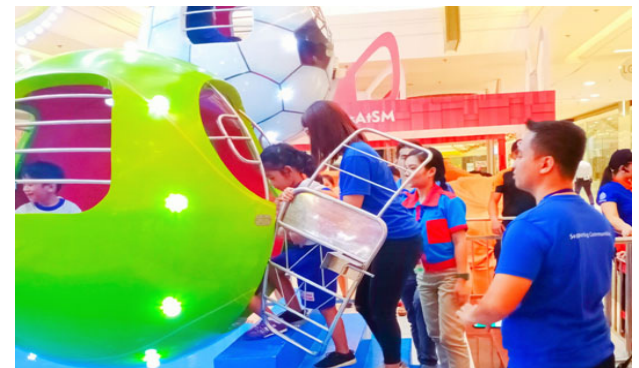
Kids enjoying the rides at SM City Bacoor's Storyland Orbiter