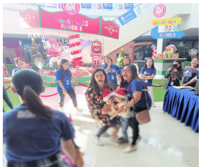
SM City Molino Volunteers Playing with the kids during the event