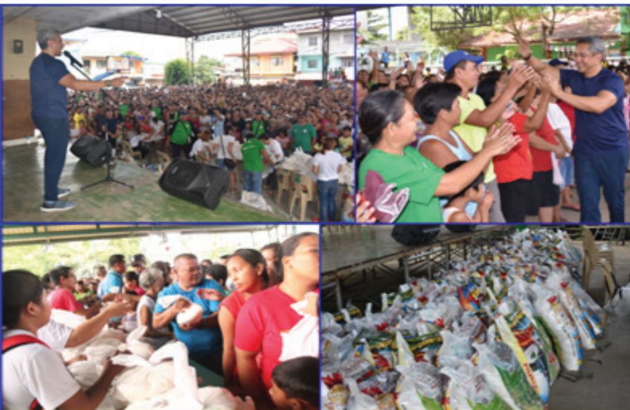
SWIFT RESPONSE TO CONSTITUENTS' NEEDS: Cavite Governor Jonvic Remulla promptly responded during the onslaught of calamity as he visited the residents of the cities of General Trias, Dasmariñas, and Imus on December 7, 2019 ensuring the safety of his constituents and bringing relief goods to the people. Six thousand five hundred relief goods were distributed to the locals of Sunnybrooke 2 and Tropical Village in Barangay San Francisco in General Trias, another six thousand five hundred packs of rice for the citizens of Zone 2 in Barangay Sampaloc 4 and Barangay Fatima 1 in the City of Dasmariñas and six thousand five hundred relief goods to the residents of Barangay Pag-asa 1 and Barangay Palico 2 in the City of Imus. Governor Remulla echoed his commitment to ease the burden of the people and swore to bring quality service to the indigent members of the community. He also encouraged everyone to call the attention of their respective leaders to immediately respond on emergencies and disasters which can help save lives and properties of the citizens. The governor also brought good news to the public as he explained the fiber optic internet connection in Cavite with more than 300 kilometers of fiber optic cables spread throughout the province making it a free wi-fi zone. The governor highlighted the importance of modernizing information technology and going with the flow of innovation which mirrors economic development in the province. Together with the governor who showed enthusiasm and compassion to their constituents were General Trias Mayor Ony Ferrer, General Trias Vice Mayor Morit Sison, 4th District Board Member Fulgencio Dela Cuesta, Cavite Councilors League President Nickol Austria, 3rd District Representative AA Advincula, 3rd District Board Members Jeffrey Asistio and Dennis Lacson, city and barangay councilors and punong barangay of the three recipient cities. —(PICAD)