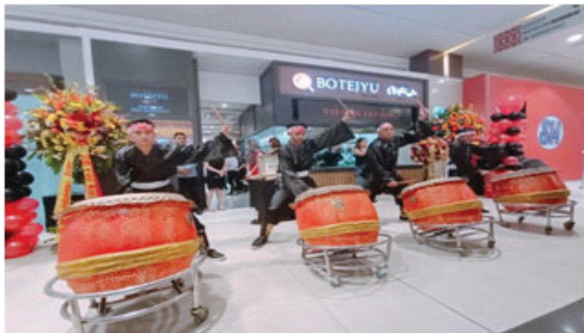
Botejyu at SM City Bacoor's Upper Ground