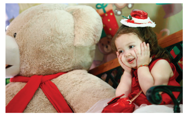
This adorable kid sat down with the giant bear at the Beary Christmas Centerpiece.