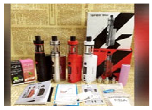
dangerous as the smoke from cigarettes,