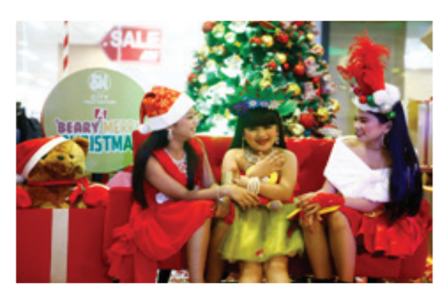
Kids in their Christmas costumes were filled with happiness and excitement