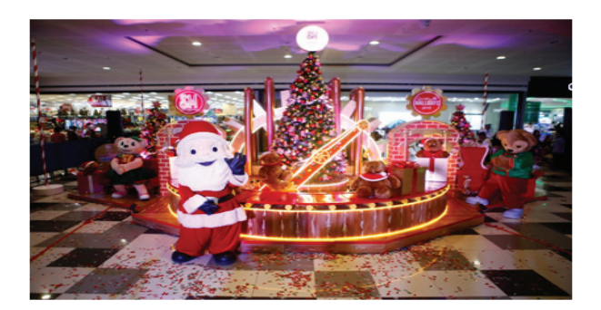
SM Santa danced with his Bear factory workers during the Christmas Centerpiece unveiling at SM City Trece Martires

Christmas is truly the brightest and happiest time of the year. From dining to gift shopping, or enjoying fun experiences – for 61 years, SM has witnessed every Filipino family's milestones and celebrations. This year, SM brings you the#SparklingSMallidaysas they unwrap a host of fun-filled activities, dazzling displays, exciting deals, and thrilling surprises to light up the lives of everyone this holiday season!