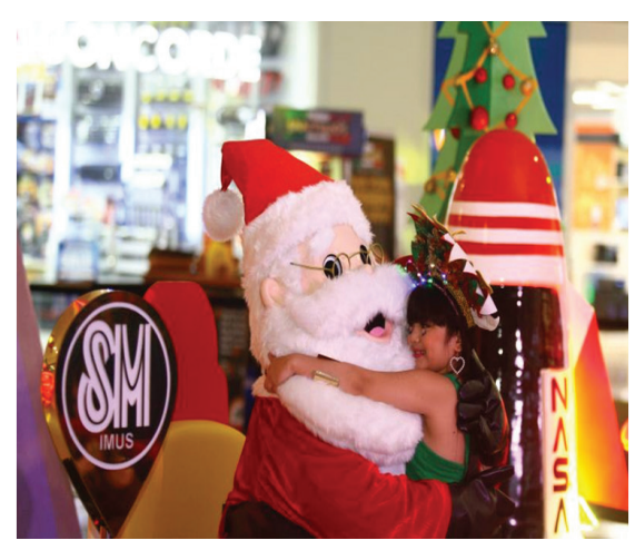
Children were thrilled to play with Santa