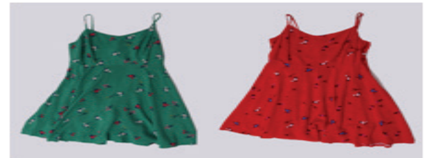
Feminine floral dresses are great for staycations, shopping adventures, and hanging out in hotspots with friends.