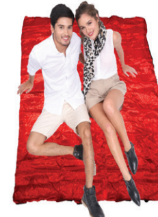
This summer's palette - earth tones are perfect for your great outdoor adventure.