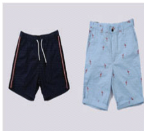
Sail along this summer with chino shorts in different colors and prints