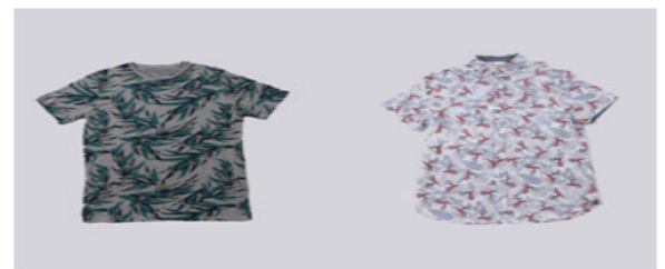
Fun prints, colorful hues celebrate summer in the city.