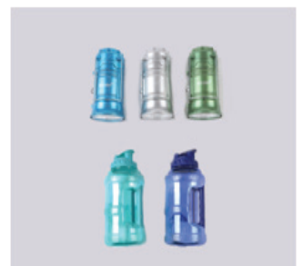
Don't forget to bring your essentials from Surplus as you take a digital detox and re-connect with nature.

BALIKATAN HOUSING FINANCE, INC. , 22/F RCBC Savings Bank Corporate Center 26th and 25th Street, Bonifacio South Bonifacio Global City, Taguig City