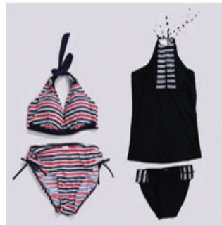
Striped swimwear for a lakeside adventure.