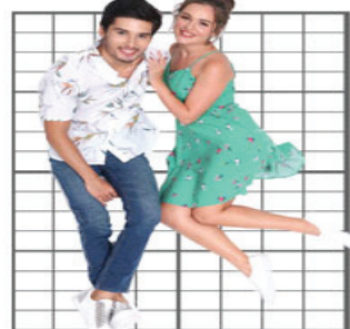
Take a stylish stroll around the metro with Surplus' cool and stunning fashion pieces.