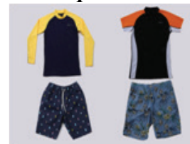
Catch the waves with sporty rashguards and boardshorts