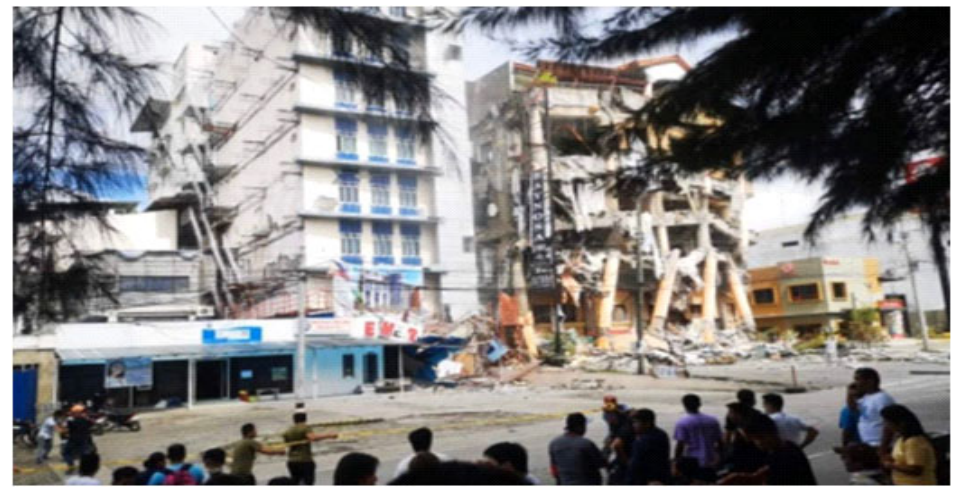
ANOTHER QUAKE. Photo shows a nearly collapsed building in Kidapawan City after a 6.5 magnitude earthquake rocked Cotabato anew on Thursday morning (Oct. 31, 2019). Malacañang assured the government is on top of the situation.

Presidential Security Group (PSG) BGen. Jose Eriel Nembra said the President and his family did not evacuate from their house but the