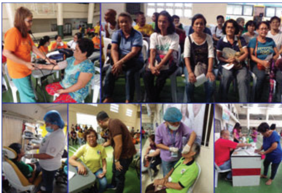
PRIORITIZING THE HEALTH NEEDS OF TMC SENIOR CITIZENS: More than 200 senior citizens and employees of the local government of Trece Martires City benefitted from the medical and dental mission sponsored by the provincial government of Cavite conducted at Trece Martires City Hall Covered Court on October 16, 2019. Medical professionals from Provincial Health Office and City Health Office rendered their services which include medical and dental check – up and tooth extraction. The successful health activity was made possible with the assistance of Inocencio Paramedic and Rescue Volunteers. Seventh District Board Member Ping Remulla together with Trece Martires City Mayor Gemma Lubigan, Vice Mayor Bobby Montehermoso and Sangguniang Panglungsod Members were in attendance and showed appreciation to the mission team headed by the OPG-Extension for continuously bringing health programs that benefitted the locals of Trece Martires. —(PICAD)