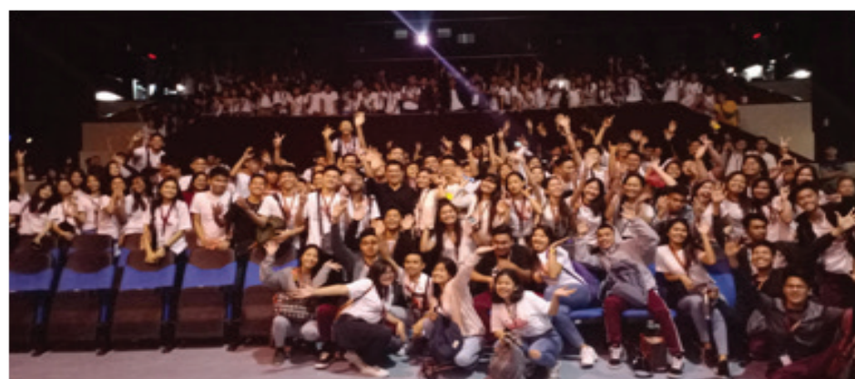
Director Brillante Mendoza with the senior high school students of the University of Perpetual Help-Molino

SM CITY MOLINO, CAVITE - On a two-day special screening last October 10 and 11, 2019, Premier Director Brillante Mendoza showcased his latest movie Hilom to 3482 senior high school students from the University of Perpetual Help-Molino Campus. The film showing, in partnership with SM