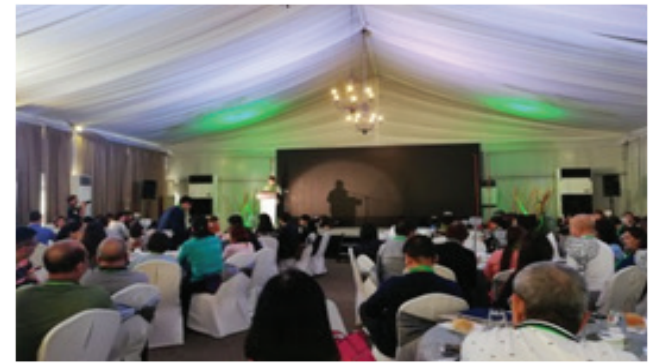
MENTAL HEALTH COUNCIL. The Department of Health in Calabarzon conducts the 2nd Regional Mental Health Summit, which sought to establish the Regional Mental Health Council in the region, held in Quezon City on Thursday (Oct. 17, 2019). The platform also seeks to provide sustainability to the current mental health programs in the country.

"That mental council would set a standard of patients' referrals, the way we [DOH] help and support the patient's mental needs which mental health care will be