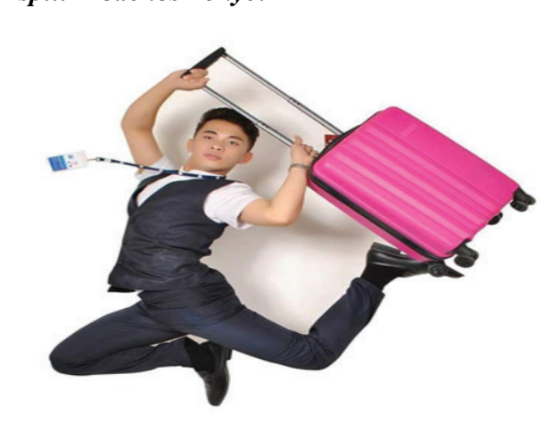
Xian's info-tainment selling approach incorporates dance skills while explaining the technical product features.