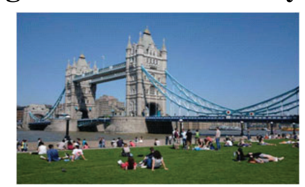
People relax in the hot and sunny weather on the grass beside Tower Bridge and the River Thames in London. London's iconic Tower Bridge celebrates its 125th anniversary on Sunday.

"There were all sorts of weird and wonderful.