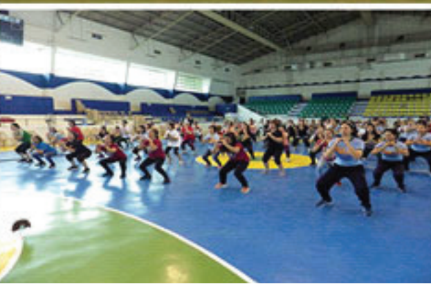
PDRRMO LEADS ZUMBA HEALTH AND FITNESS FOR DISASTER PREPAREDNESS: Employees of the Provincial Government of Cavite and other national agencies in the province joined the Zumba health and fitness workout spearheaded by the Provincial Disaster and Risk Reduction Management Office recently at the Provincial Gymnasium in Trece Martires City. The purpose of the event is to improve body coordination and maintain physical fitness which is essential for disaster preparedness and immediate response during calamity. Participants danced their heart out to maintain great shape and were somehow given a short break from office work to loosen up and interact with fellow public servants. Zumba dance workout is also beneficial especially for those who have limited time or are not capable of intense workouts as it can be done at the comfort of their homes.