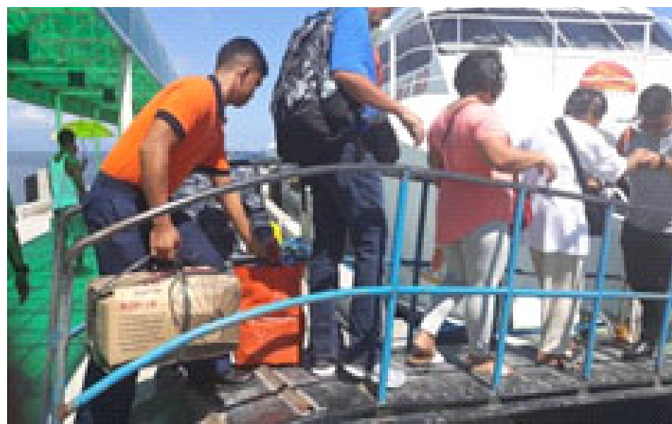
Passengers board on a sea vessel docked at the Calapan Port in Oriental Mindoro this Wednesday.