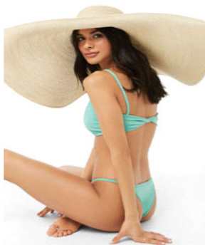
Soak up in the sun with an oversized floppy straw hat and sage-colored bikini from Forever 21.