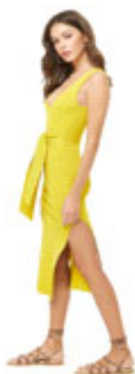
Citrus Crush: Citron ribbed midi dress from Forever 21