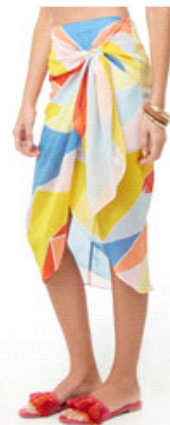
Colorblock sheer sarong skirt