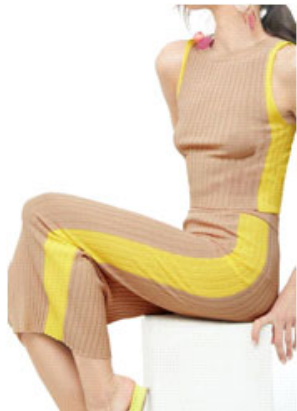
Side-striped ribbed top worn with a midi skirt