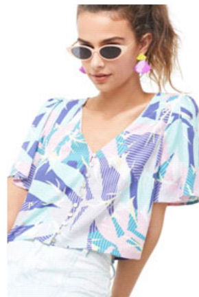
Summer Swing: Cool-toned tops and bright-colored accessories