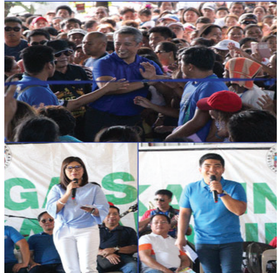
Bacoor Residents Join the PGC's Kalinga sa Kalikasan: Thousands of environment volunteers from the City of Bacoor joined in the Provincial Government of Cavite's Kalinga sa Kalikasan program conducted in Brgy. Ligas 2 and Queens Row Central on March 19, 2019. Governor Jonvic Remulla together with Vice Governor Revilla led the environmental awareness campaign and encouraged the people to continuously support all the programs of the provincial government. Bacoor City Mayor Lani Mercado-Revilla warmly welcomed the visitors and participants of the event. Board Members Edralin Gawaran and Reynaldo Fabian was also present to support the activity.