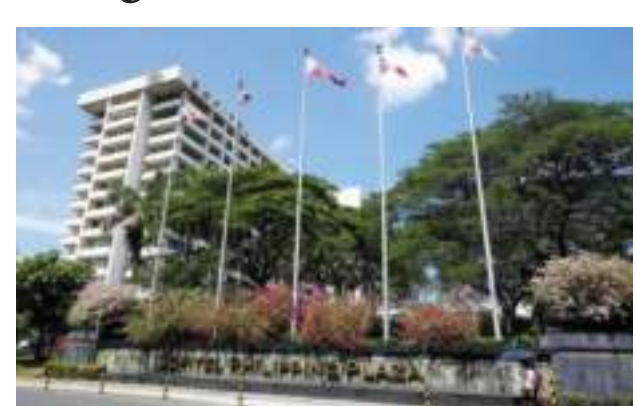
END OF AN ERA. The facade of the Sofitel Philippine Plaza Manila in Pasay City in this photo taken on Monday (May 13, 2024). Beginning July 1 of this year, the 48-year-old five-star hotel with a view of Manila Bay will close its doors and cease public operations.

"We are very dismayed with the announcement of the impending closure of