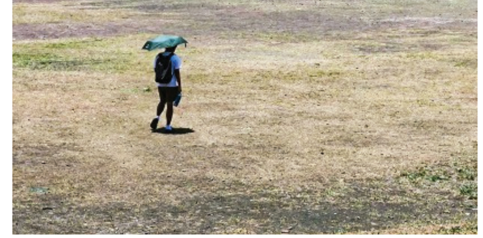
DEHYDRATED. A man walks on dried grass at the University of the Philippines Sunken Garden in Diliman, Quezon City on April 24, 2023. At least 30 areas are forecast to experience danger level heat index, while the country will continue to experience fair weather with isolated rain showers, the weather bureau said Monday (May 6, 2024).