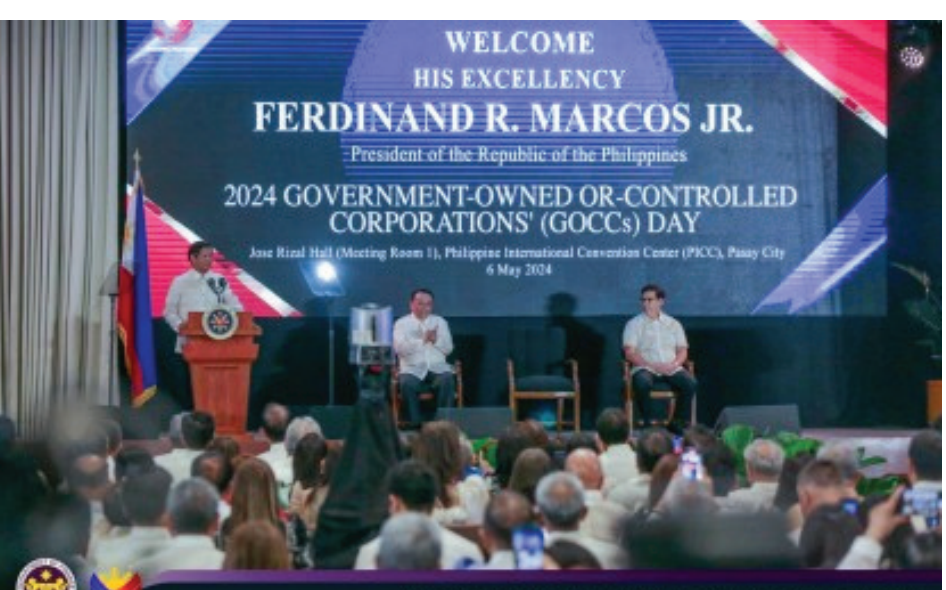
GOCC DAY. President Ferdinand R. Marcos Jr., Executive Secretary Lucas Bersamin (middle) and Finance Secretary Ralph Recto lead the Government-Owned- or Controlled Corporations (GOCCs) Day celebration in Pasay City on Monday (May 6, 2024). The GOCC Day aims to acknowledge the top-remitting GOCCs that significantly contributed dividends to the national government.

The top GOCCs that contributed at least PHP1 billion were the Land Bank of the Philippines (PHP32. 1 billion); the Philippine Deposit Insurance Corporation (PHP10.7 billion); the Bangko Sentral ng Pilipinas (PHP9.2 billion); the Philippine Ports Authority (PHP5 billion); the Philippine Amusement and Gaming Corporation (PHP4.6 billion); the Manila International Airport Authority (PHP3.5 billion); the Subic Bay Metropolitan Authority (PHP3 billion);