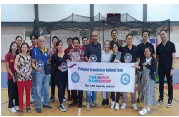
KOREA-BOUND. Members of Team Philippines bound for the 2024 Korea Exposition drone soccer pose for a photo in this undated photo. The competition is part of the May 9 to 11 expo in Songdo Convensia in Incheon, South Korea.

"The drone soccer game is an emerging technology that can also be used in various fields such as surveillance in agricultural