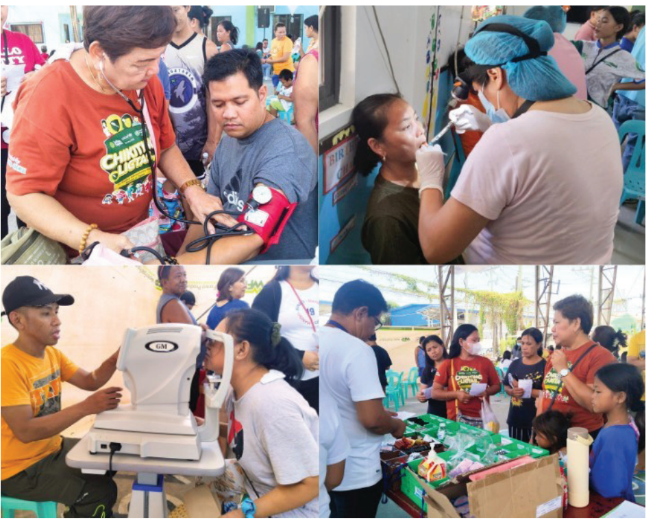
Medical and Dental Mission Benefits 358 Residents.

I have seen something further under the sun, that the swift do not always win the race, nor do the mighty win the battle, nor do the wise always have the food, nor do the intelligent always have the riches, nor do those with knowledge always have success, because time and unexpected events overtake them all. Ecclesiastes 9: 11