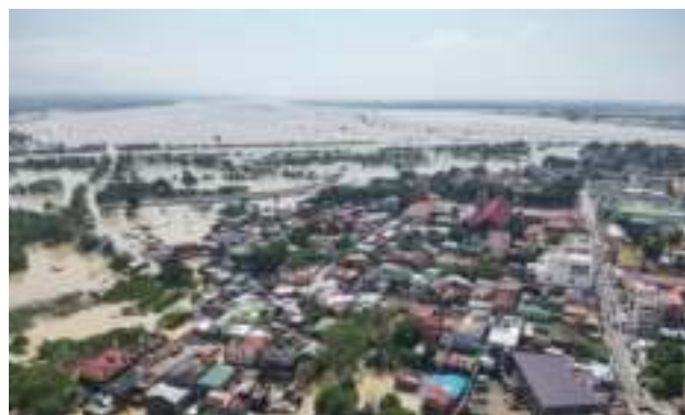
Flooded areas in low-lying parts of Tuguegarao City, Cagayan on Tuesday (Nov. 12, 2024)

In a press conference at Malacañang in Manila, Remulla