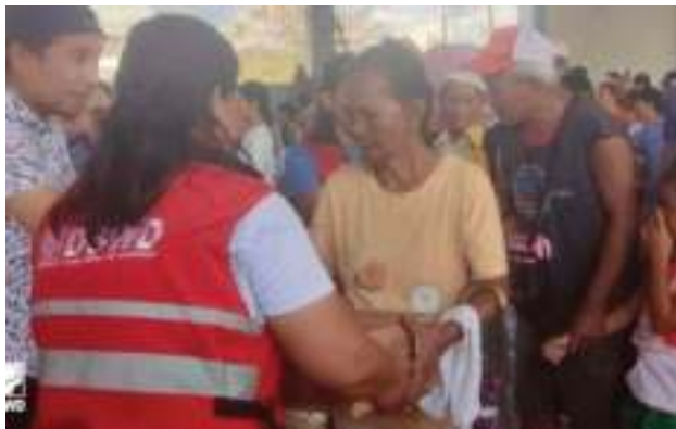
FOOD PACK DISTRIBUTION. Personnel of the Department of Social Welfare and Development (DSWD) distribute family food packs to residents of Dilasag town, Aurora province on Tuesday (Nov. 12, 2024). DSWD Secretary Rex Gatchalian assured they are always ready to provide FFPs and non-food relief items to families hit by Severe Tropical Storm Nika.

He likewise thanked the Department of Labor and Employment