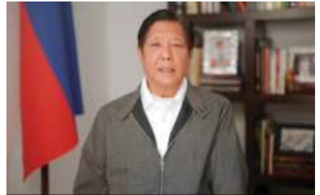
President Ferdinand R. Marcos Jr. (File photo)

Nika will continue moving west north-westward over the West Philippine Sea and exit the Philippine