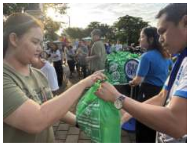
A Kalinga pack is being handed by an SM City Rosario employee to a woman residing in Cavite City.

More than 3,000 Kalinga packs were distributed in total by SM City Rosario to families affected by Typhoon Kristine across several towns, including Noveleta, Cavite, through SM Cares' Operations Tulong Express program. In addition to Noveleta, Kalinga packs were also provided to families in Cavite City, Kawit, and Rosario, Cavite. This generous effort highlights SM's commitment to supporting communities in times of crisis and helping families rebuild their lives.