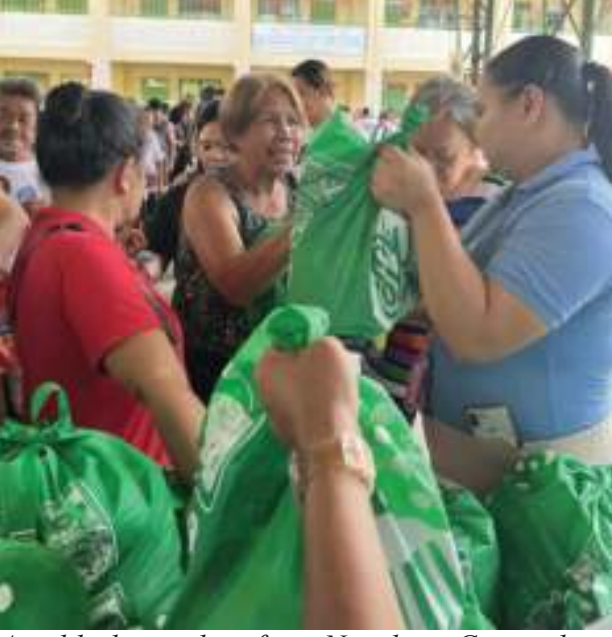
An elderly resident from Noveleta, Cavite, happily receives a Kalinga pack.

The woman from Kawit, Cavite, receives a Kalinga pack handed to her by the Mall Manager of SM City Rosario.