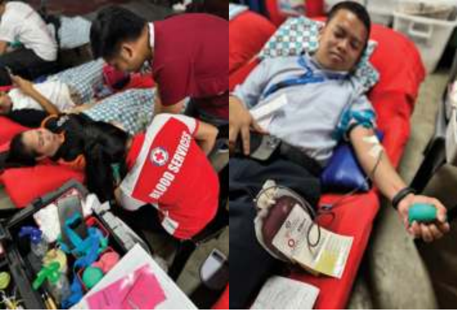
Community Unites for Red Cross Blood Donation Drive at SM City Dasmariñas and SM Marketmall

Over a hundred blood donors, including employees, tenants, and shoppers, gathered at SM City Dasmariñas and SM Marketmall to participate in the Red Cross blood donation drive. This event not only encouraged community involvement but also highlighted the importance of blood donation in saving lives. The enthusiastic response from donors reflects the community's commitment to supporting those in need during critical times.