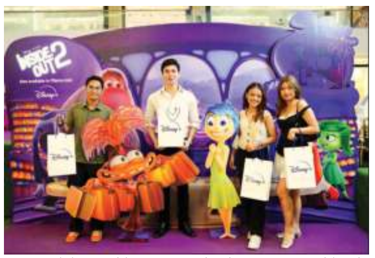
Cebuanos attend the "Inside Out 2" activation at SM Seaside City Cebu

Fans of the beloved Disney and Pixar film "Inside Out 2" had the opportunity to create lasting memories with their favorite characters at SM Supermalls. Joy and Sadness, the iconic duo from the film's original five-personified emotions (the others being Anger, Fear, and Disgust), made special appearances at SM Seaside City Cebu on October 3, SM City North EDSA on October 5, and SM City Dasmarinas on October 6.