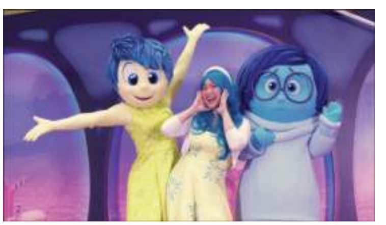
A fan embraces their inner Joy with a blue wig at the "Inside Out 2" event at SM City North EDSA.

Children and adults alike lined up for unforgettable photos with the lovable characters. The event was a heartwarming reminder of the power of emotions and the importance of finding balance in our lives.