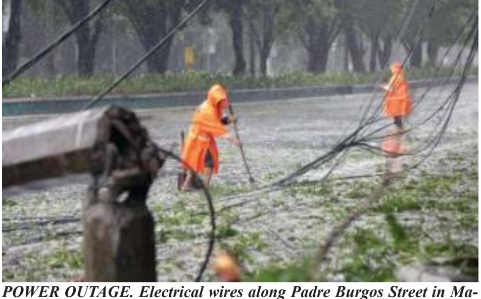
nila are damaged by Tropical Storm Enteng on Monday (Sept. 2, 2024). Meralco said 4,000 customers, mostly in Metro Manila, Cavite, and Rizal, were experiencing power interruptions on Tuesday (Sept. 3, 2024) due to the impact of inclement weather.

He said farmer cooperatives and entrepreneurs may use the name of Kadiwa to sell agricultural commodities in their areas, provided adherence to