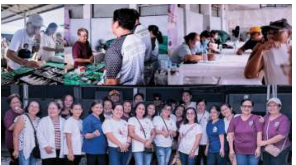
An impactful Medical Mission was conducted in Poblacion V, Mendez.

The initiative is part of the continuous outreach programs aimed at bringing healthcare closer to the grassroots level, ensuring that every Caviteño has access to essential medical and dental care. - OPIO