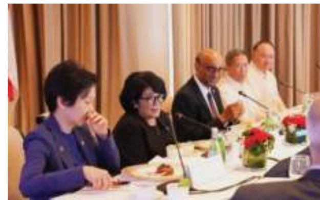
PARTNERS ON CLIMATE ACTION. DENR Secretary Maria Antonia Yulo-Loyzaga (2nd from left) and Singaporean Minister for Sustainability and the Environment Grace Fu Hai Yien (left) discuss mutual efforts on climate action cooperation in a luncheon for Singaporean President Tharman Shanmugaratnam (center) at the The Peninsula Manila in Makati City on Aug. 16, 2024. The two countries committed to deepen cooperation in exploring solutions towards climate resiliency.

Loyzaga said both sides would work together in achieving tangible gains against the impacts of climate change for both nations and setting a benchmark for science-informed bilateral and public-private cooperation in environmental stewardship.